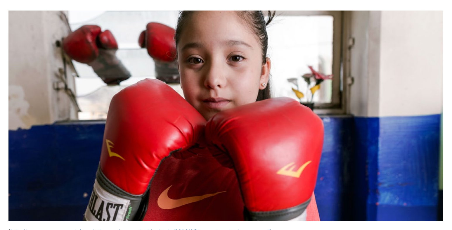
{\it $^3$} \underline{\text{http://www.womenssportsfoundation.org/wp-content/uploads/2016/08/go\_out\_and\_play\_exec.pdf}

with their friends" may not focus on girls' skill development as much as they would if coaching boys. Any of these behaviors, while not necessarily intentional, could influence how fulfilled and challenged a girl feels from their sport experience. Becoming more aware of biases about the role of women and girls in sport and using strategies to overcome them is fundamental to changing the way girls are treated in sport. Coaches also might simply be unaware of ways that girls are feeling unwelcome in the sport context or are facing barriers that they need extra support to overcome. Since coaches are at the core of how girls experience sport, we want to give coaches tangible tools they can use to create more inclusive sport and play environments.