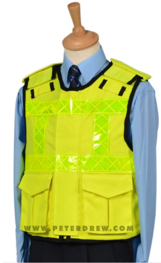
OVERT - YELLOW