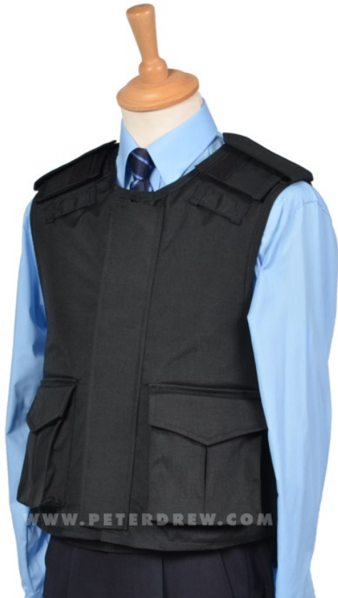
OVERT - BLACK