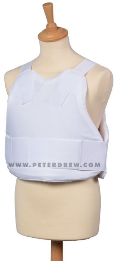
COVERT - WHITE