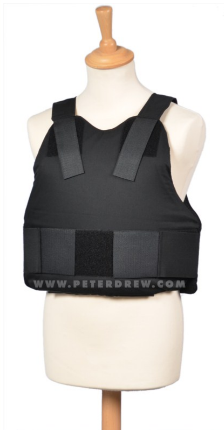
COVERT - BLACK