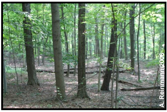
Upland hardwood forest

Upland (non-wetland) forests are the most prevalent and extensive habitats <u>represented</u> in the region. They are extremely variable in vegetation, ages and sizes of trees, size of forest patches, and character of the forest habitats, but forests of all kinds can provide valuable habitats for common and rare plants and animals. Large forests are critical habitats for many area-sensitive species—including raptors, songbirds, reptiles, amphibians, large mammals—that are disappearing from our increasingly fragmented rural landscapes. Because forests facilitate efficient water infiltration through the soils, forest preservation is perhaps the most effective means of maintaining the quality and quantity of groundwater and surface water resources. Forests provide many other essential services such as climate moderation and carbon sequestration.