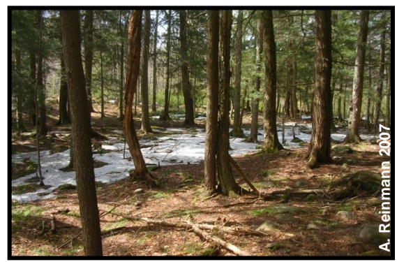
Upland conifer forest

These are just a few of the species of regional or statewide conservation concern that are known to occur in upland forests. See Kiviat & Stevens (2001) for a more extensive list.