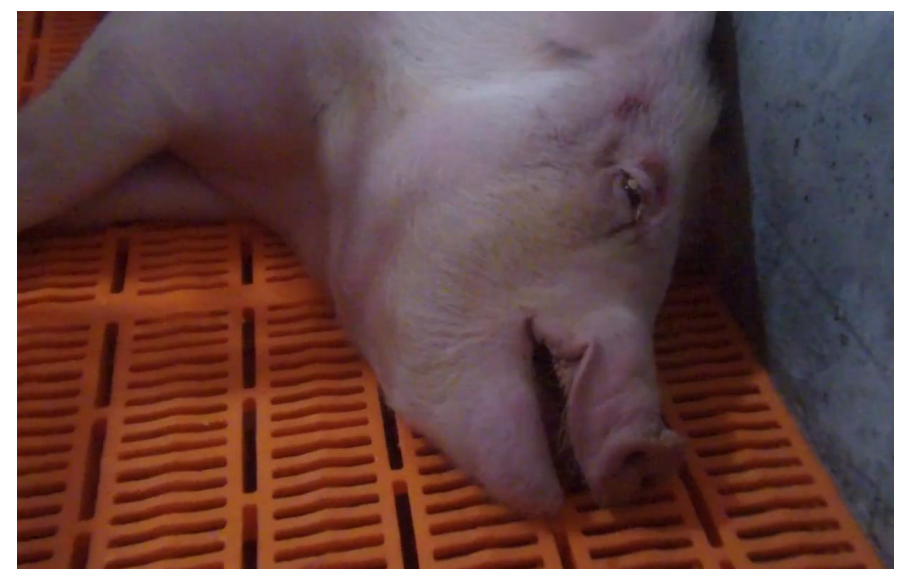
iii. Undisclosed Location (2022)

The following image depicts a pig who was deprived of veterinary care and left to suffer and die in her own waste: