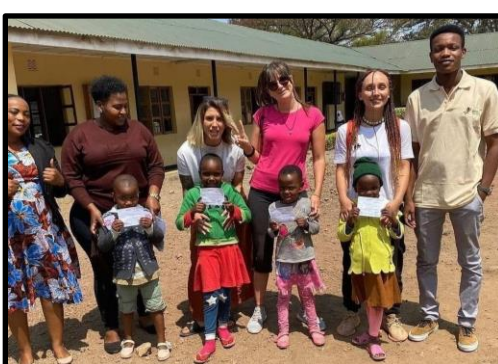
Names of Children who have been sponsored through Karibu Foundation