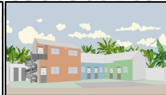
Construction of dormitory for children at Evererate Orphanage