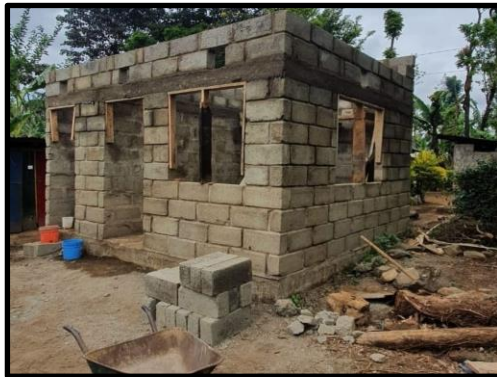
On-going construction of new kitchen at Love Angels