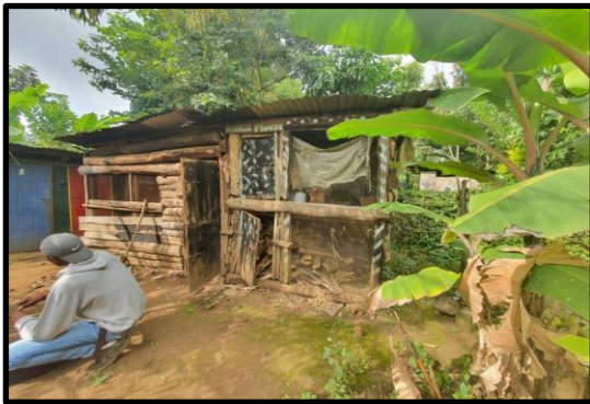
Love Angels kitchen before demolition