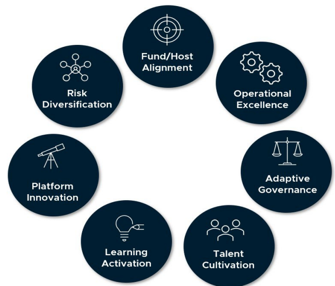
Figure 2: Seven Enabling Factors for Collaborative Funds

As a tool to guide an effective selection process for fund host organizations, we have created a chart that can aid in identifying a “fit-for-purpose” host based on the needs and characteristics of the collaborative fund [Exhibit 1].