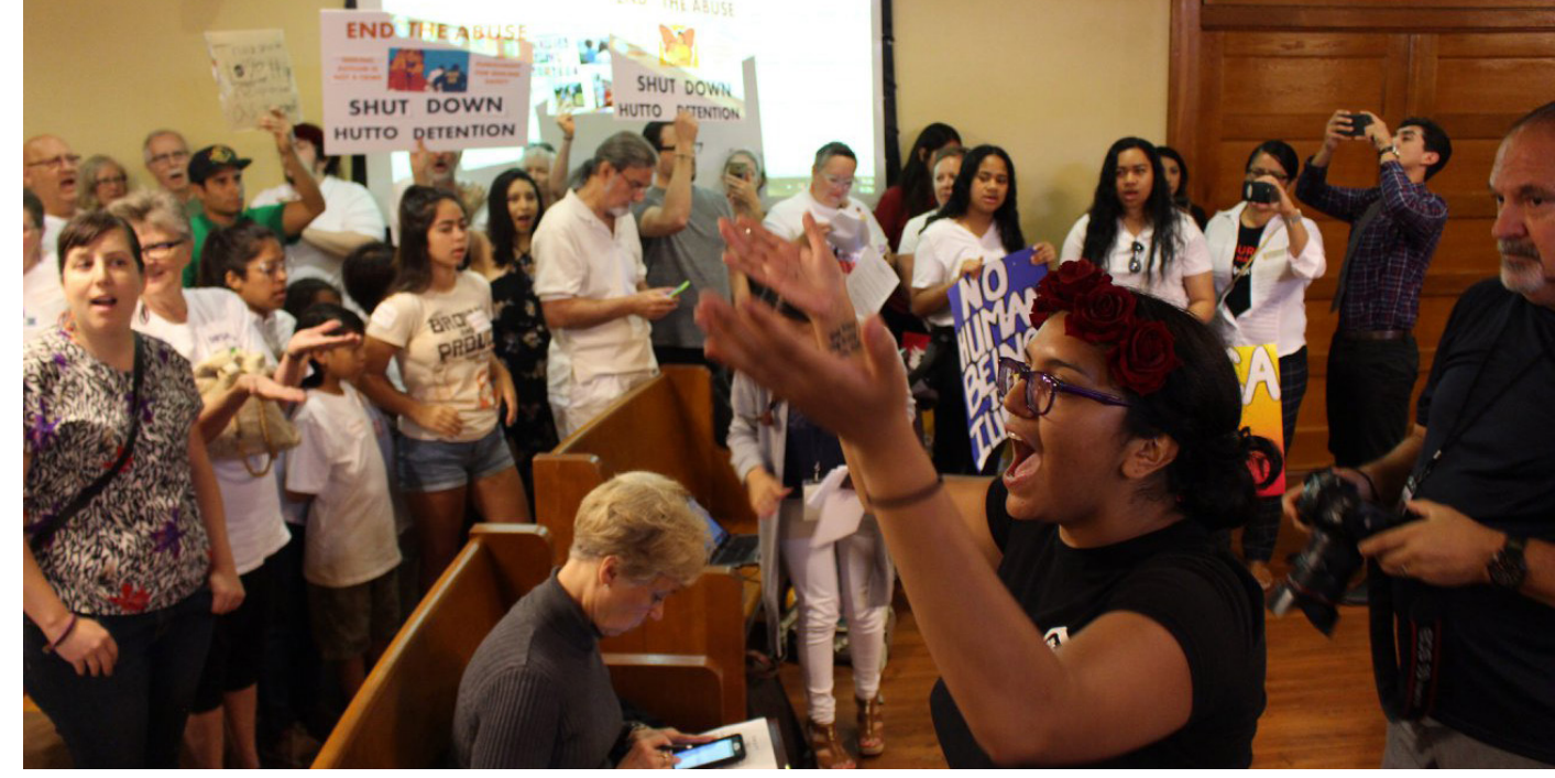
Community members sing inside a packed county courthouse before the Commissioner's Court vote to end the county's contract for Hutto.

question the Hutto contract, a party with a stake in the case—such as a bidder that was not chosen would have to bring suit for the process to be scrutinized in court. Detained women and immigration advocates likely have no such ability and so the suspect handling of the contact will probably never be scrutinized by a court.