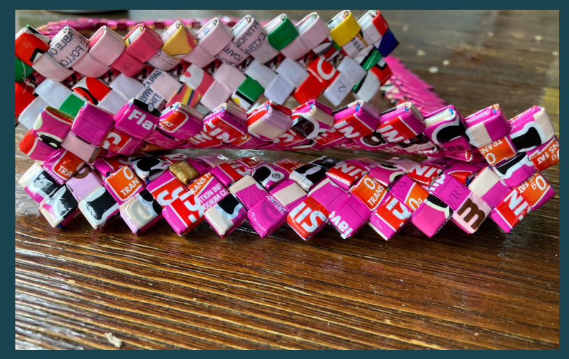
Handicrafts made of packaging from ramen soups purchased in the commissary.

At Hutto, I suffered discrimination at the hands of the guards just because I was an indigenous woman, and I do not speak