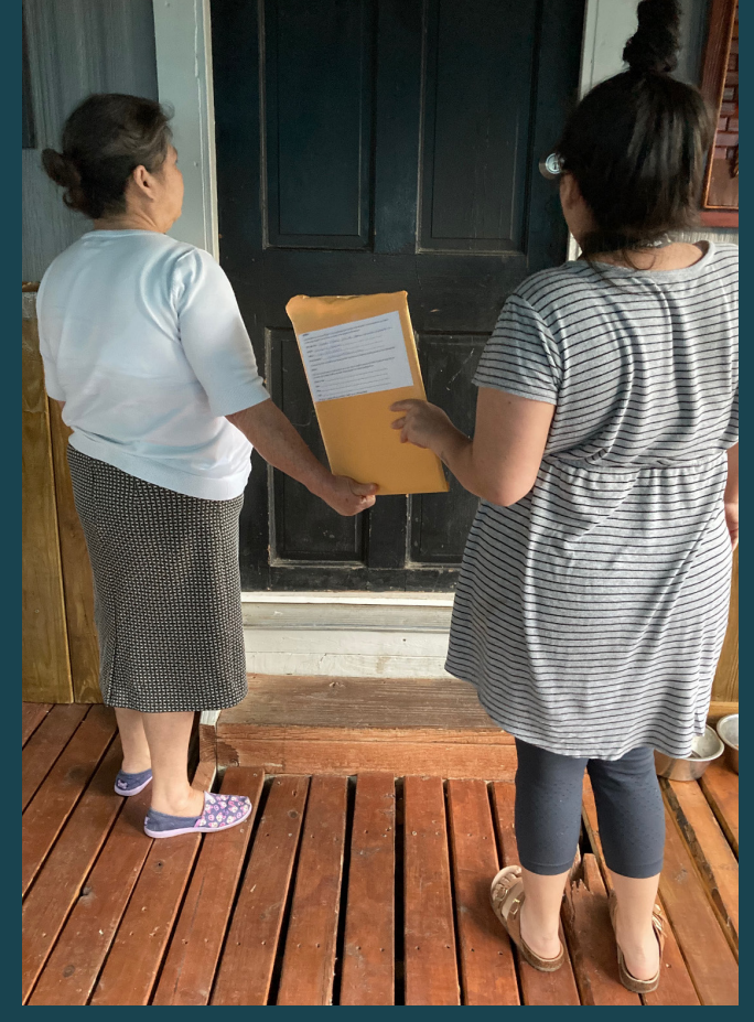
Reuniting with family after separation caused by detention.

Lam an older woman, and I suffer from diabetes, high cholesterol, and high blood pressure. When the Immigration authorities arrested me and took me to the T. Don Hutto jail, they took all of my belongings and threw away the medicines that I had brought with me from Mexico. I told them that I needed the medicines and that they were important for me. The officials just