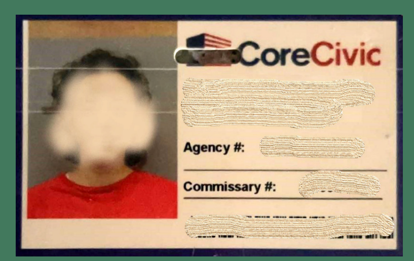
CoreCivic identification card issued to women detained at Hutto.

It is so unfair that they treat us immigrants without respect or mercy. Being at Hutto was traumatic, because the guards did