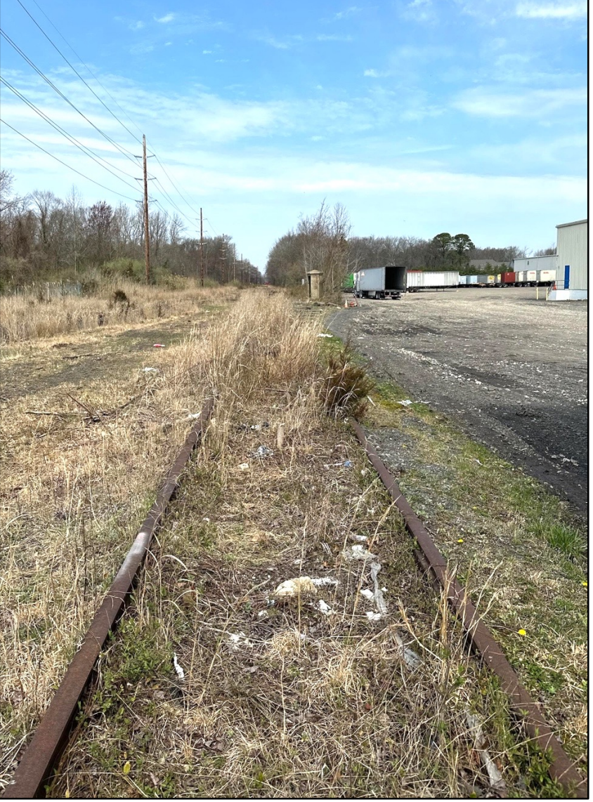
View of Delaware & Raritan River Railroad Freehold Branch facing (Timetable) North from Southard Avenue at Farmingdale, taken shortly after vegetation clearing was completed in February 2023.

F&S Connection II SCHEDULE 2303L SOUTHARD TRACK REPLACEMENT