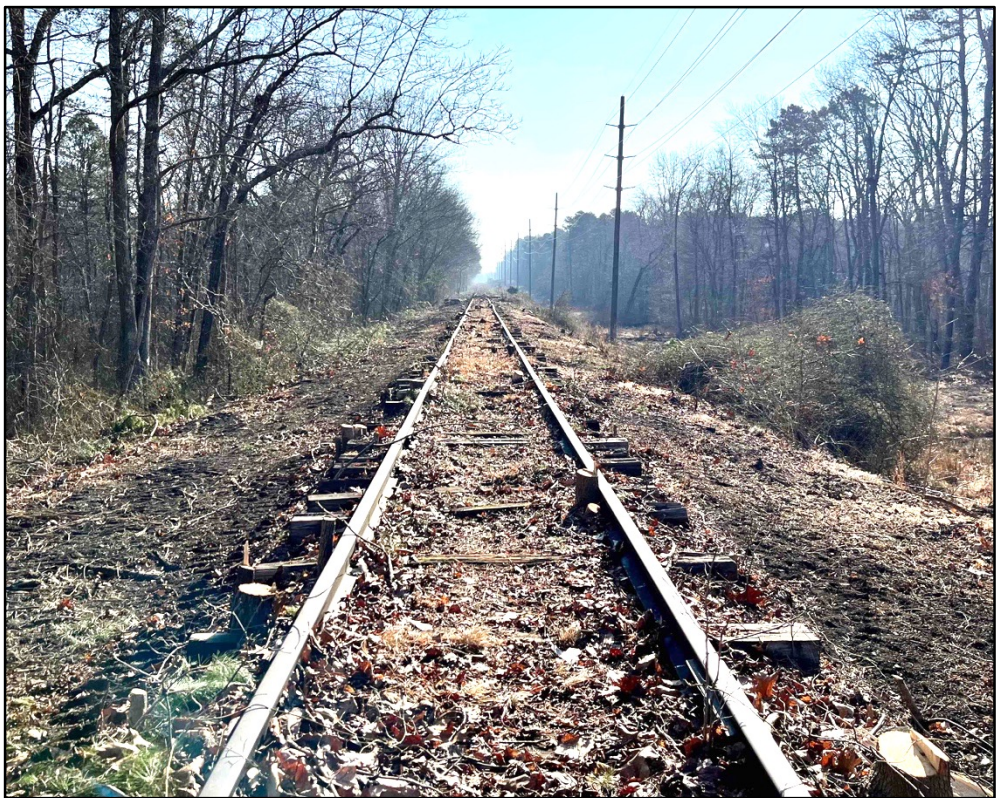
View of Delaware & Raritan River Railroad Freehold Branch facing (Timetable) South between Fairfield and Yellowbrook Roads, shortly after vegetation clearing was completed in February 2023.

1. The Schedule 2303K workscope includes the replacement of approximately 9,764 track feet of existing predominantly 130#PS on wood ties, knocking down the cribs and preparing a new subgrade and constructing approximately 1,400 track feet of new track reusing the 130#PS rail on wood ties, and constructing approximately 8,364 track feet of new track using 132#RE or 136#RE rail on steel ties.