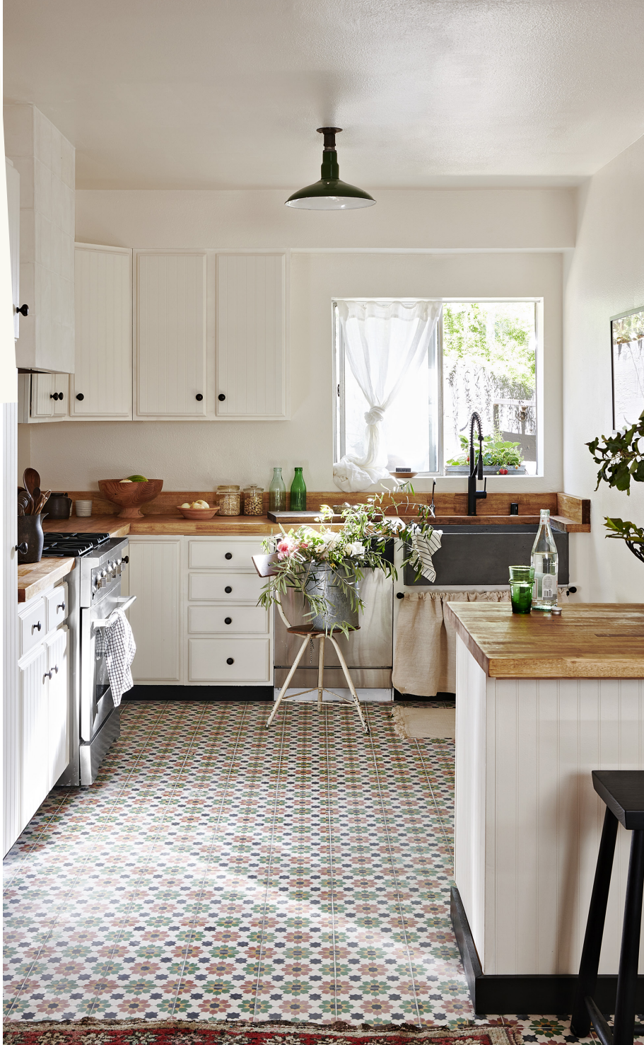
Sourcebook on page 110

The finished kitchen stayed true to our original vision for a lighter, brighter place to spend time together. The patina on the playful tile will only look better as it ages. The strawberry plant growing outside the window over the sink means they will always have a piece of nature in reach.