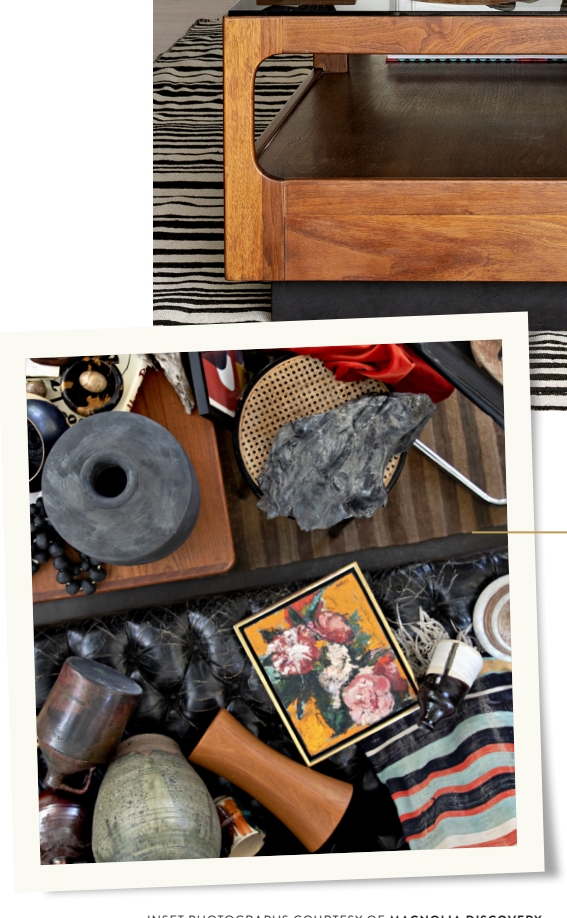
INSET PHOTOGRAPHS COURTESY OF MAGNOLIA DISCOVERY VENTURES LLC. © 2023. ALL RIGHTS RESERVED. INTERIOR PHOTOGRAPHS BY AMY NEUNSINGER