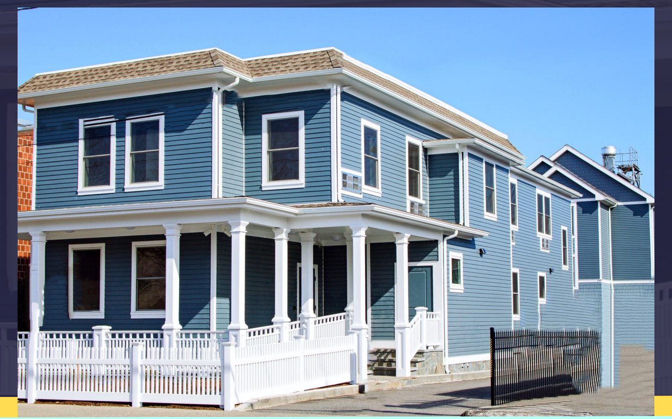
PACIFIC HOUSE NORWALK PROPERTY

We're incredibly proud to sponsor Pacific House, an organization that tirelessly turns roots of struggle into roofs of opportunity for the Fairfield County community. Their work goes beyond just housing. They restore dignity, hope, and self-sufficiency for every individual they serve.