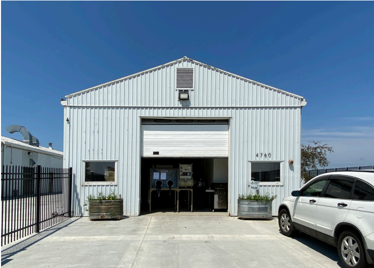
NORTH BUILDING FACADE