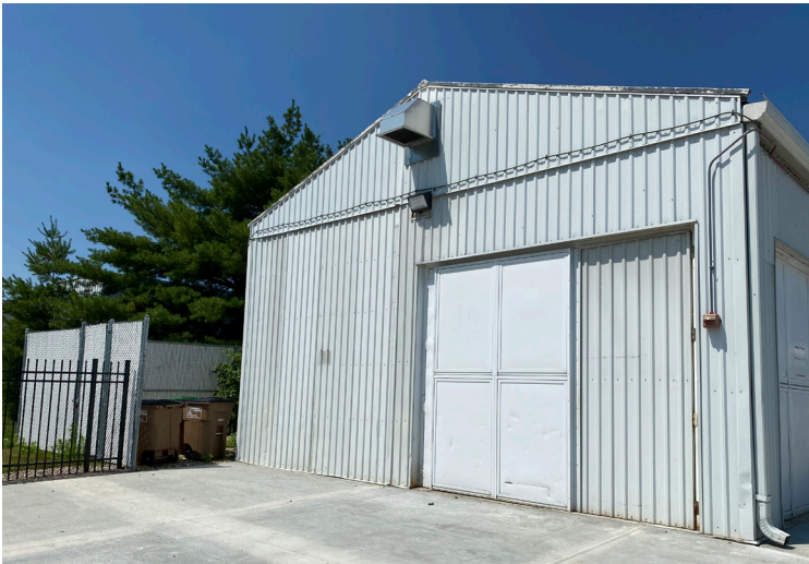
SOUTH BUILDING FACADE