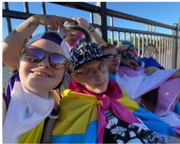
YLC members attending Pride Fest

That's a wrap: Our ILS group ended programming in May. This semester they learned about: credit cards, auto loans, credit reports & scores, mortgages, housing, down payments, retirement accounts, accounting, interest & fees, tax returns, income & sales tax, credit reports & scores, identity theft, discretionary income, auto, life and renters insurance, preparing for college, ATM withdrawals, overdrafts, tipping and more!