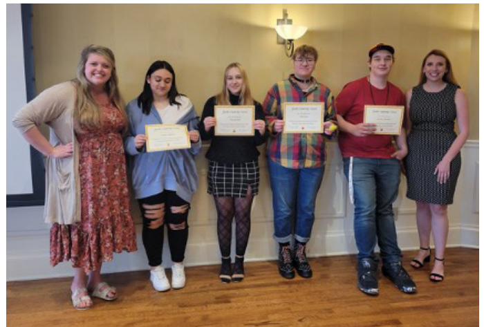
YLC year-end banquet

In order to be able to continue to support the youth in Red Wing, we need your help. If you are able to make a financial donation at this time, we have several options available: