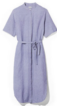
PETER PARADISE DRESS