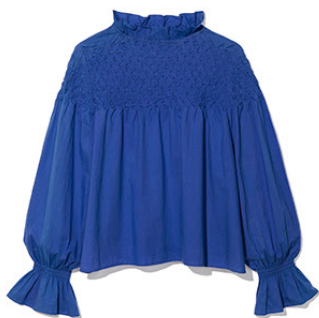
MAJORELLE HAND SMOCKED HIGH-NECK BLOUSE