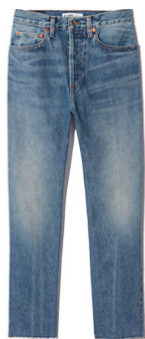
HIGH RISE STOVE PIPE 27"