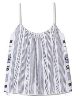
YESHI SWING CAMI