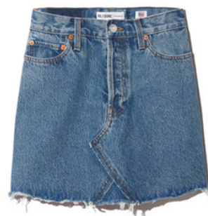
HIGH-WAISTED MINI SKIRT