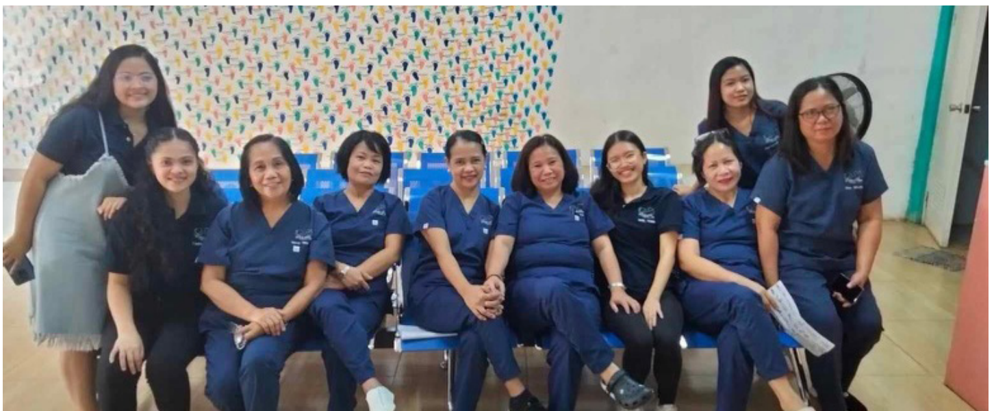
Updated photo of our Hope Alive Staff.