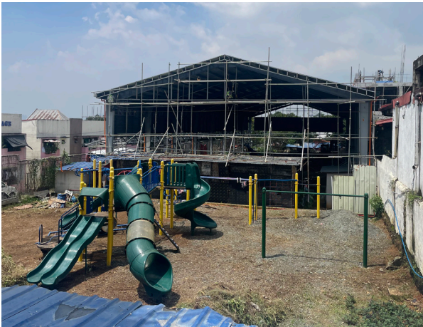
Top: CCS High School physical education class. Middle Left and Right: Roof of outside basketball & volleyball is on! Bottom Left: CCS elementary students enjoying their new playground. Bottom Right: Completed high school classroom supported by a new donor of ours.