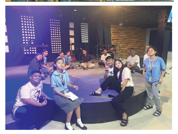
Our CCS worship team began their first chapels singing "Yes, Lord, Yes!". What a joy to see both the students and teachers begin a new school year!