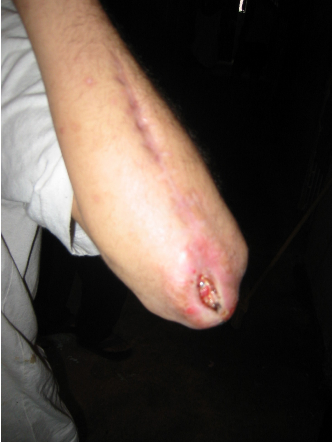
A youth in Santo Expedito shows an open wound.