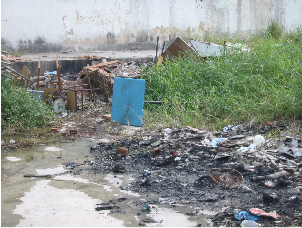
Trash, standing water, and weeds cover a basketball court in Santo Expedito.