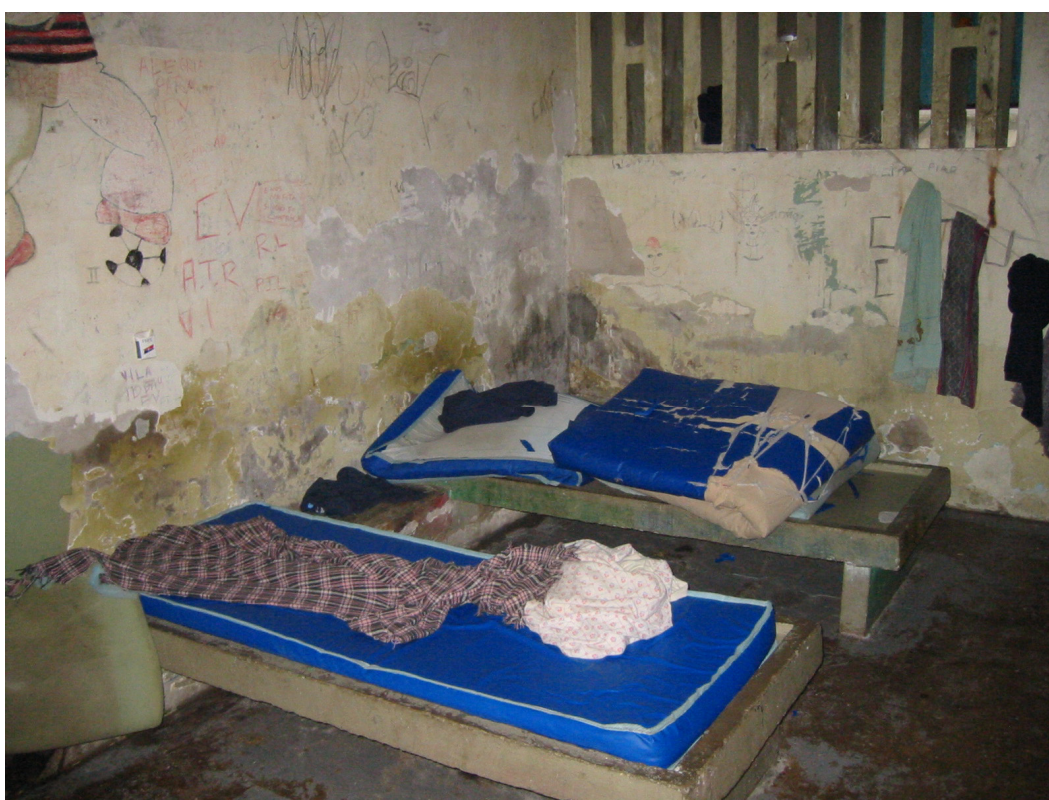
A dormitory in CAI-Baixada.

The violence against juvenile delinquents in Rio's detention centers has created a new phenomenon: In the last five months, the state public defender's office has found eighteen adolescents who preferred to complete their punishment among adults in police stations or prisons rather than submit to socio-educational measures in state [juvenile detention] facilities. That is, each month at least three youths pretend to be adults when they are taken prisoner by the police. Discovered by public defenders or by nongovernmental organizations, they say that it is better to be in the state prison system—implicated in recent months by denunciations of torture, death, and corruption—than to be detained in Department of Socio-Educational Action (DEGASE) institutions. 163