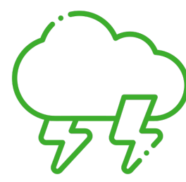
THUNDER AND LIGHTNING