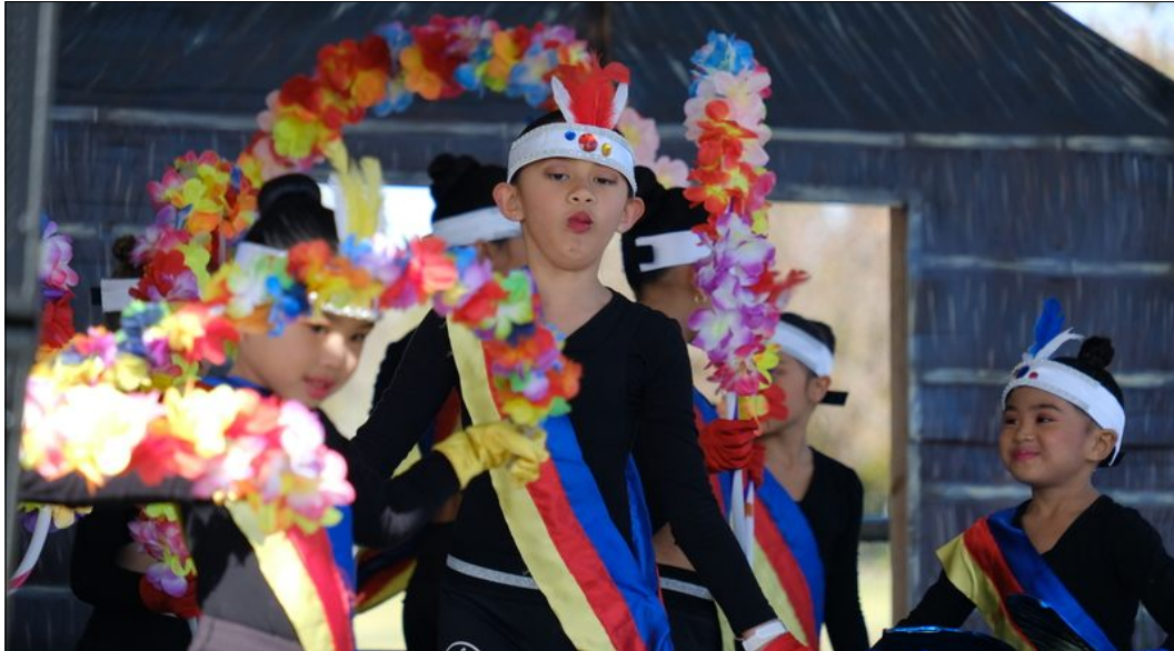
Above: Filipino kids gave a gala feature performance at the Festival.