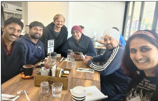
The Indian Communities Group planning meeting.