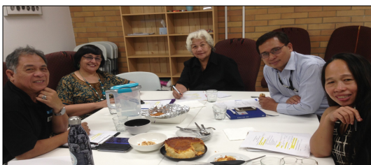
TLC Festival meeting with the FABICCQ Committee