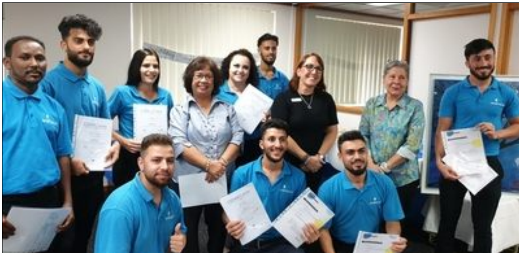
Above: The Diversity Project trainees at their graduation.

The workshops (pic above) were translated into Kurmanji and Arabic. They covered a wide range of topics to provide job seekers with practical information regarding their next steps in getting a job. Covid restrictions required scaling down the events. The Diversity Project students organised the events as their traineeship.