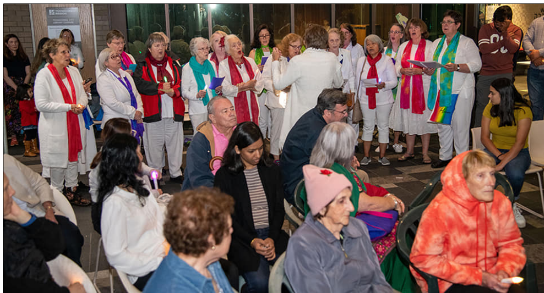
Above: Women In Harmony performing at the Candlelight Vigil.