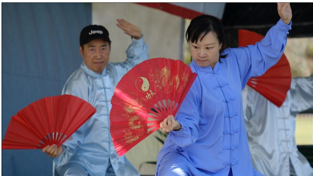
Above: The Chinese Taoist group performed the Fan and Sword Dance.