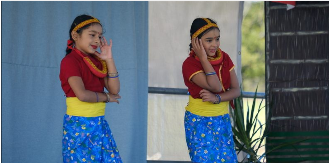
Above: Nepalese children performed their folk dances