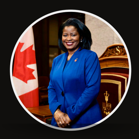
SENATOR AMINA GERBA