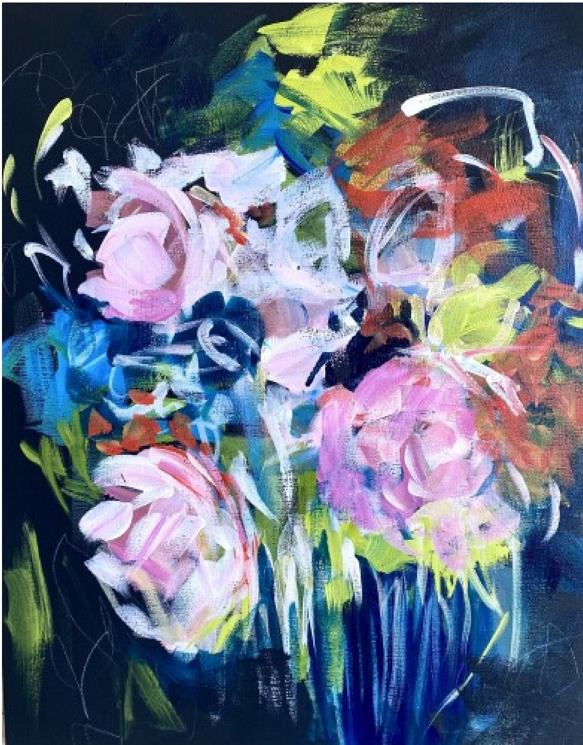
"Rainbows from the Basement" acrylic on canvas, 16" x 20"

Fresh flowers in a home are always uplifting, but not always available. A painting of flowers is eternal and lives on long after the real petals have faded.