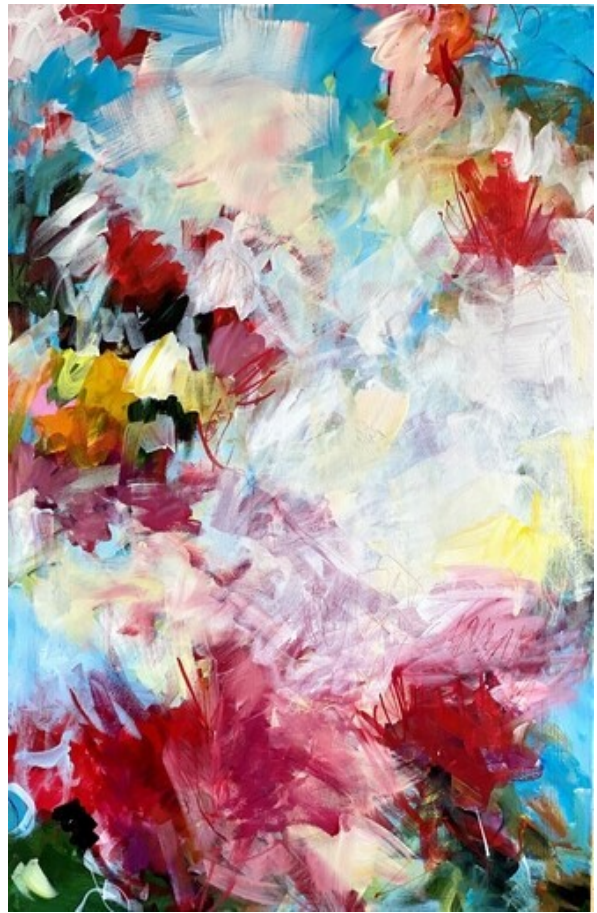
"Blossoms from Beyond" acrylic on canvas, 24" x 36"

Painting nature is like a horticultural ice cream parlor. I'm always mixing magenta, yellow and orange to get combinations that don't exist in the paint tube in an effort to express endless nuances of saturated color.