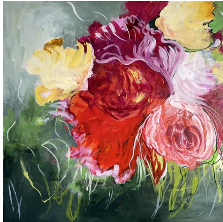
"Summer Dream" acrylic on canvas, 20" x 20"

Deep hued backgrounds highlight the luminous shades of flowers, evoking feelings of mystery and hidden depth, bringing history to contemporary art.