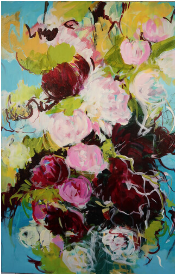
"Love and Tenderness" acrylic on canvas, 24" x 36"