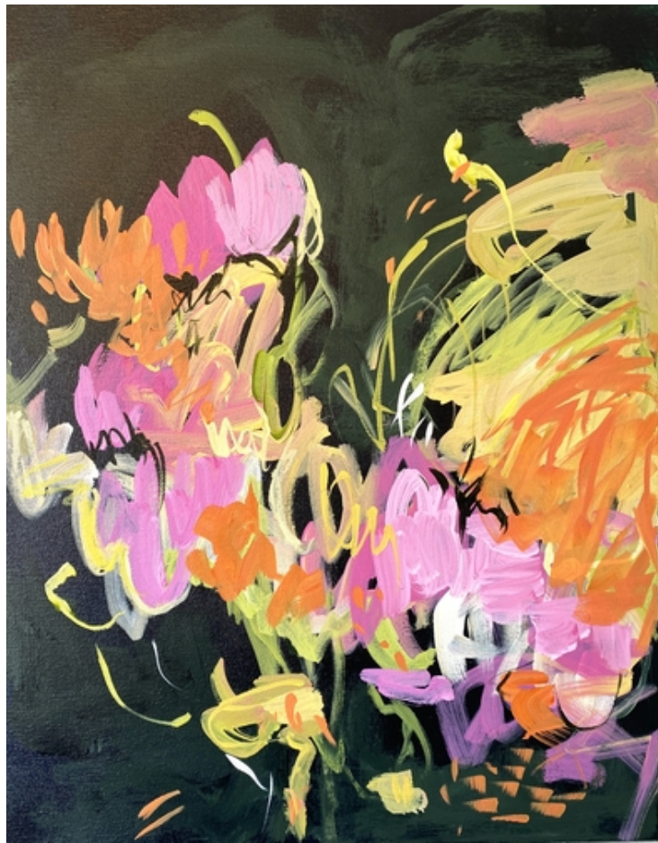
"True Romance" acrylic on canvas, 16" x 20"

Deep hued backgrounds highlight the luminous shades of flowers, evoking feelings of mystery and hidden depth, bringing history to contemporary art.