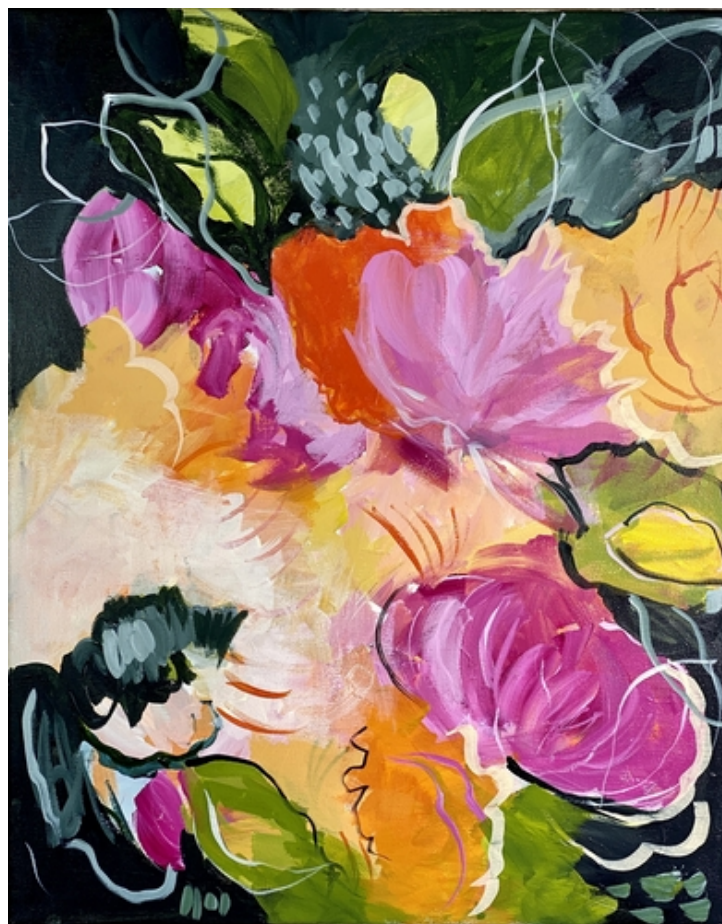
"Nothing but Flowers" acrylic on canvas, 16" x 20"

I'm always yearning for the bursts of blooms and vibrant colors of nature in spring and summer. Living in Montreal, Canada, where winter looms cold, dark and long, I see flowers as my antidote; the uplifting force that brings me light.