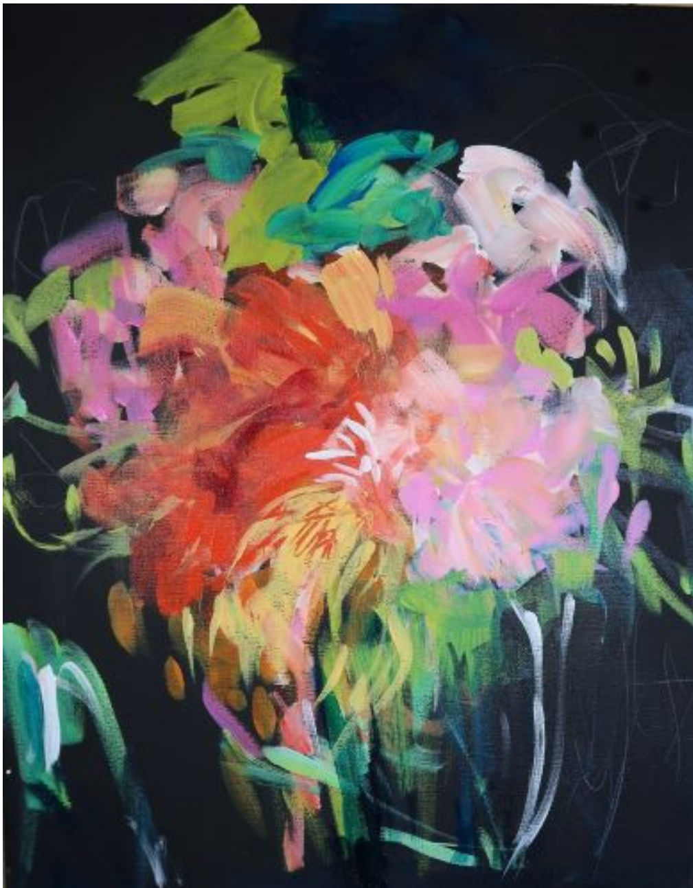
"Under the Midnight Sky" acrylic on canvas, 16" x 20"

I strive to paint the essence of flowers and nature, the sensation of the sun beaming on my face, the wind rustling the leaves and the feelings that stir my heart. I love building layers with acrylic paint, pencil and crayon. I use fresh, playful elements to infuse my artwork with vibrant color and rich organic details.