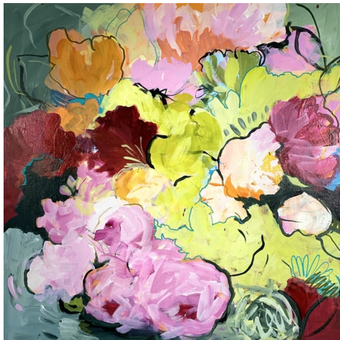
"Once More With Feeling" acrylic on canvas, 20" x 20"

Painting nature is like a horticultural ice cream parlor. I'm always mixing magenta, yellow and orange to get combinations that don't exist in the paint tube in an effort to express endless nuances of saturated color.