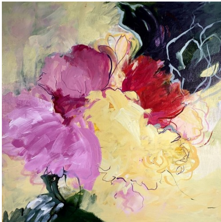
"Ode to Flowers" acrylic on canvas, 20" x 20"

I'm always yearning for the bursts of blooms and vibrant colors of nature in spring and summer. Living in Montreal, Canada, where winter looms cold, dark and long, I see flowers as my antidote; the uplifting force that brings me light.