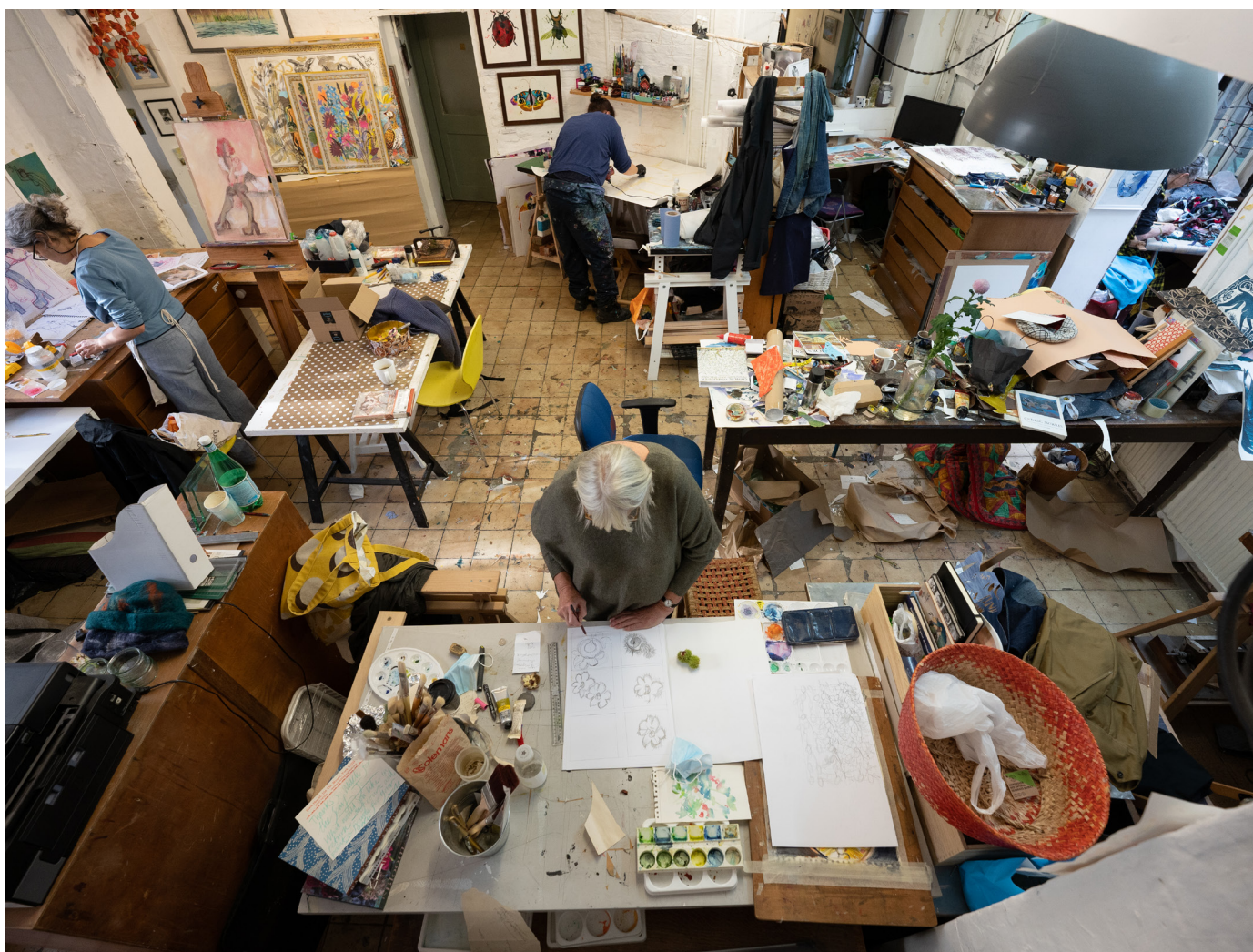
PICA Studios, York