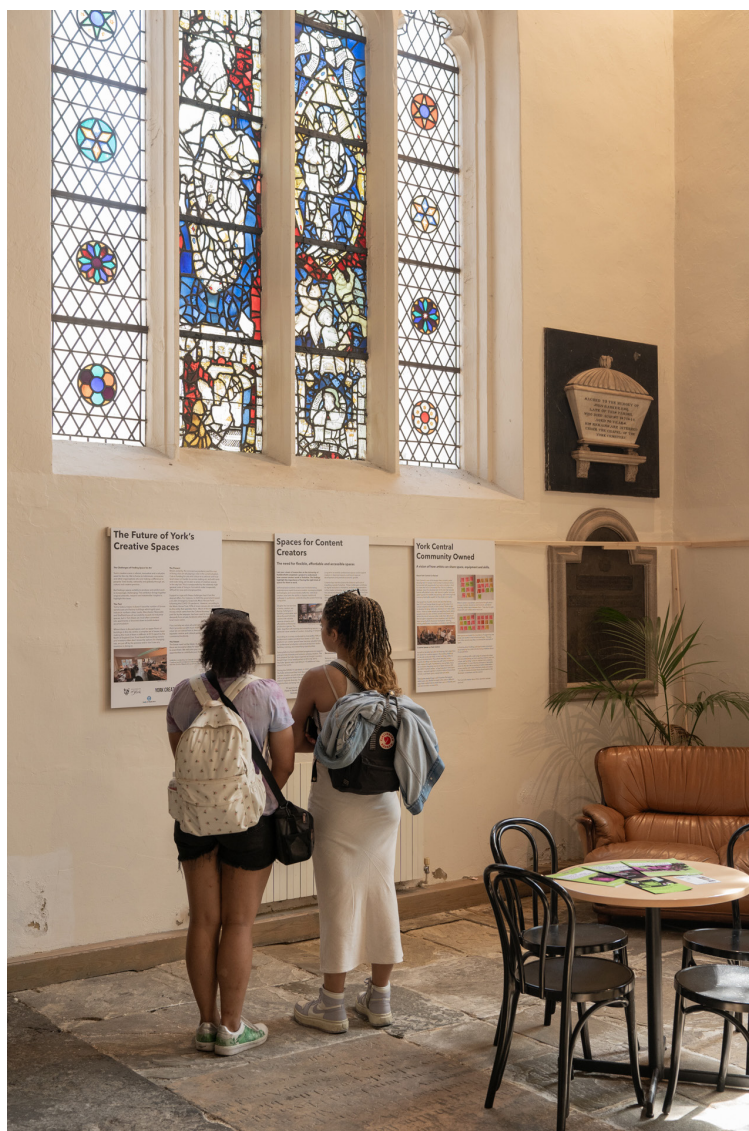
Visitors to the Creator Spaces Exhibition, July 2024

All new development projects must prioritise benefits for the communities they purport to benefit.