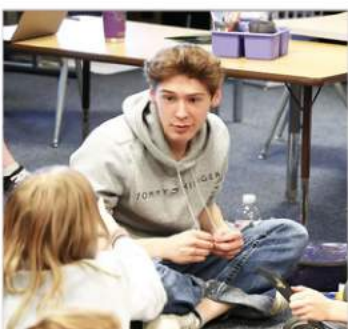
"MY MENTOR. HE'S THE BEST!" - 4TH GRADER

"Twice a month mentors and mentees meet at NES. They eat lunch together, have recess together, and have whole group activities. The room is abuzz with excited fourth graders. It is clear that these teenagers are making a positive impact on these elementary students' lives."