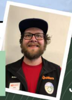
HEAR TORIN'S JOURNEY

“To have a positive role model was super big for me.”