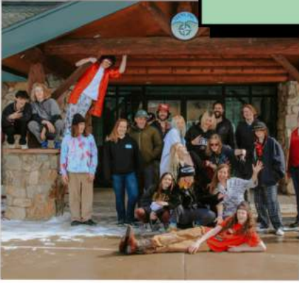
CHINOOK WEST HIGH SCHOOL