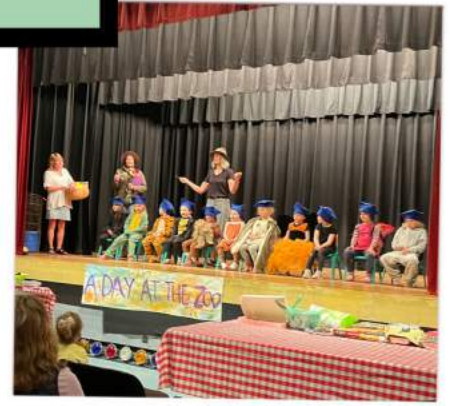
NEW EXPLORERS LEARNING CENTER

has been a TEENS, Inc. effort since 2015. TEENS, Inc. runs the high school for teenagers who have been placed at Lookout by the courts. Students earn a diploma or GED and then transition into a Career Technical Education program such as culinary arts, hairstyling, graphic design or construction trades.