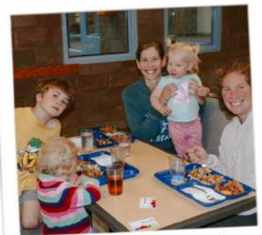
A FAMILY DINNER AT MOUNTAIN STRONG FAMILIES

Youth can enact real change when given the opportunity. Providing that opportunity is the goal of YLA, The Mountain Coalition for Youth , and the Nederland Youth Board .