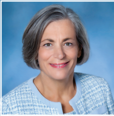
Jewish Community Foundation President and Chief Executive Officer