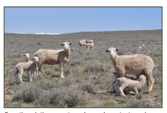
Even though the correct ram is very important, producers should not forget about the ewes in their flock.

your one-stop shop for industry resources and information. Visit www.LambResourceCenter.com to learn more.