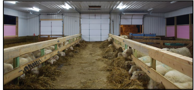
Figure 3. An insulated, indoor birth facility with a center aisle feeding system. This barn has sufficient attic insulation to stay above freezing during the vast majority of winter in southern Michigan with animal heat alone. Side wall curtain ventilation allows for air intake and exhaust. Balancing humidity and warmth requires management finesse in such a system.

In cold climates, an indoor lambing facility is needed for accelerated production as at least one of the lambing periods will take place in winter. (Figure 3) Although not an absolute