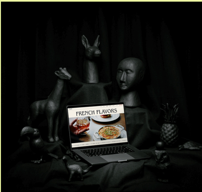
Exquis Template by Square Design

Many of the world's top design agencies work this way now - using systems and frameworks rather than starting from scratch - because it delivers better results more consistently. The differentiator is knowing how to customize these foundations effectively, which is where our expertise comes in."