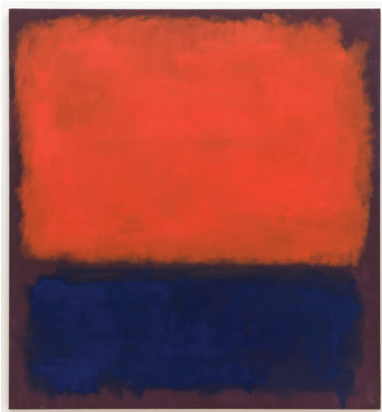
Mark Rothko's "No. 14" (1960)

Theatre Exile is known within the arts community to be the place where theater artists take some of their greatest risks. The actors are challenged by the characters' emotional journey. The designers are encouraged to be bold and to lean into the intimacy of our space. This season we are taking what has always been behind the scenes at Theatre Exile and bringing it on stage. We are focusing on the artist's journey and the importance of the artist's voice in society. Nietzsche said, "We possess art, let us perish from the truth". Mark Rothko, the abstract visual artist, embraced that philosophy. He was constantly fighting the tragedy of life and putting it on the canvas. He said "behind the color lies the cataclysm." Thank you for joining us in Exile to explore the artist's journey and how it reflects questions in our lives.