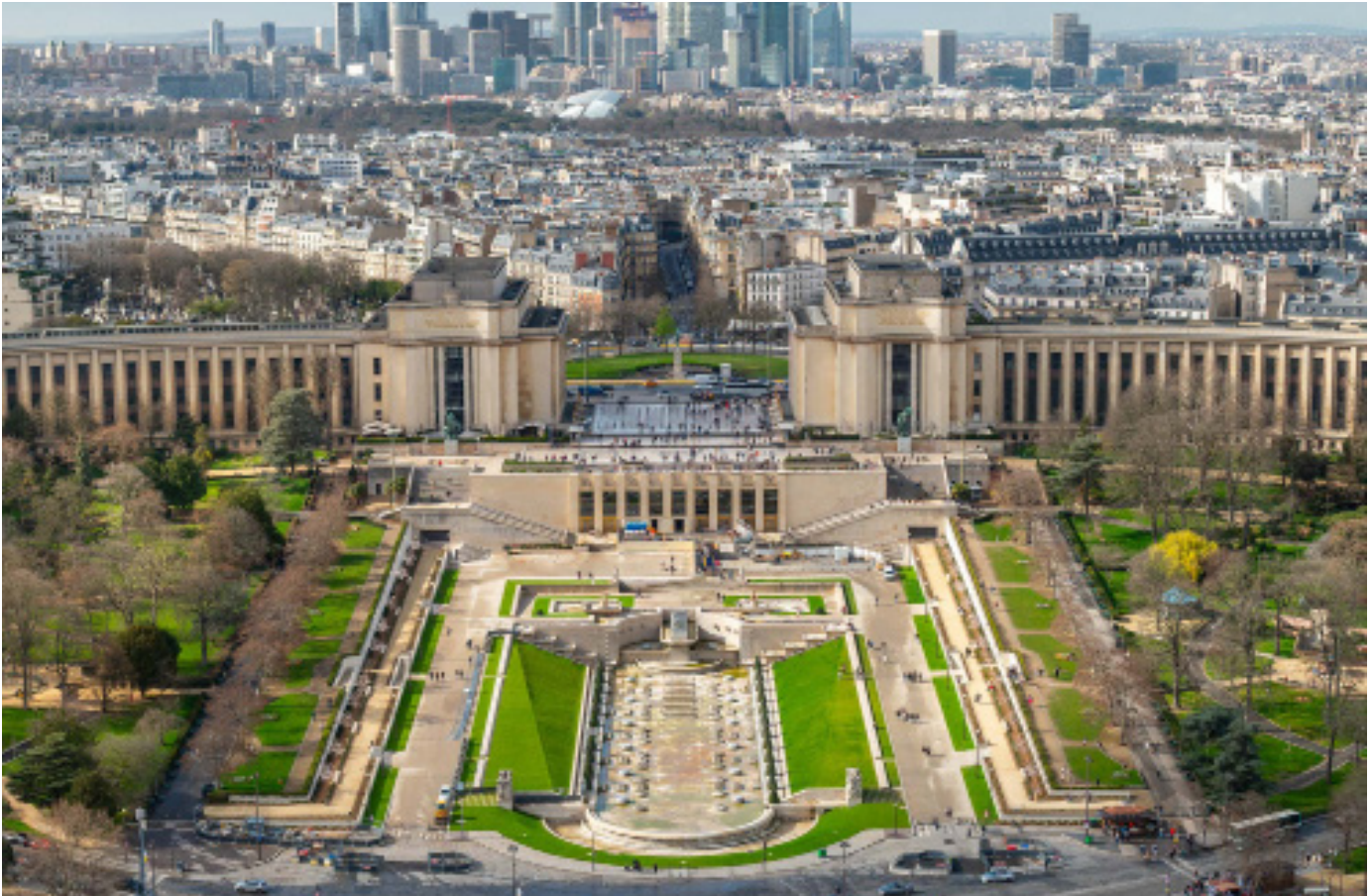
Newly renovated historical sloped lawns, terraces and promenades around the Fontaine de Varsovie.