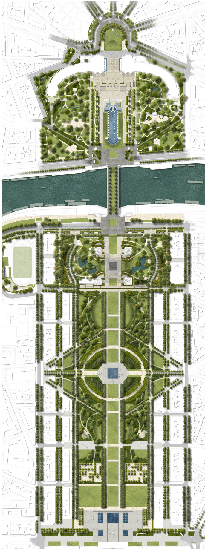
Masterplan of the 54ha site ©GP+B

Every year, 30 million people visit the Eiffel Tower situated in the heart of Paris. Seven million choose to ascend the monument for soaring views over the city. One of the most iconic landmarks in the world, the site is a victim of its popularity. Fundamental issues like over-crowding, impaired accessibility, lack of services, and overwhelmed gardens have impeded the experience of the Eiffel Tower and its surroundings.