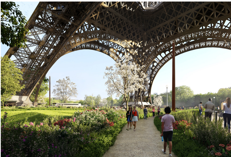
Eiffel Tower gardens