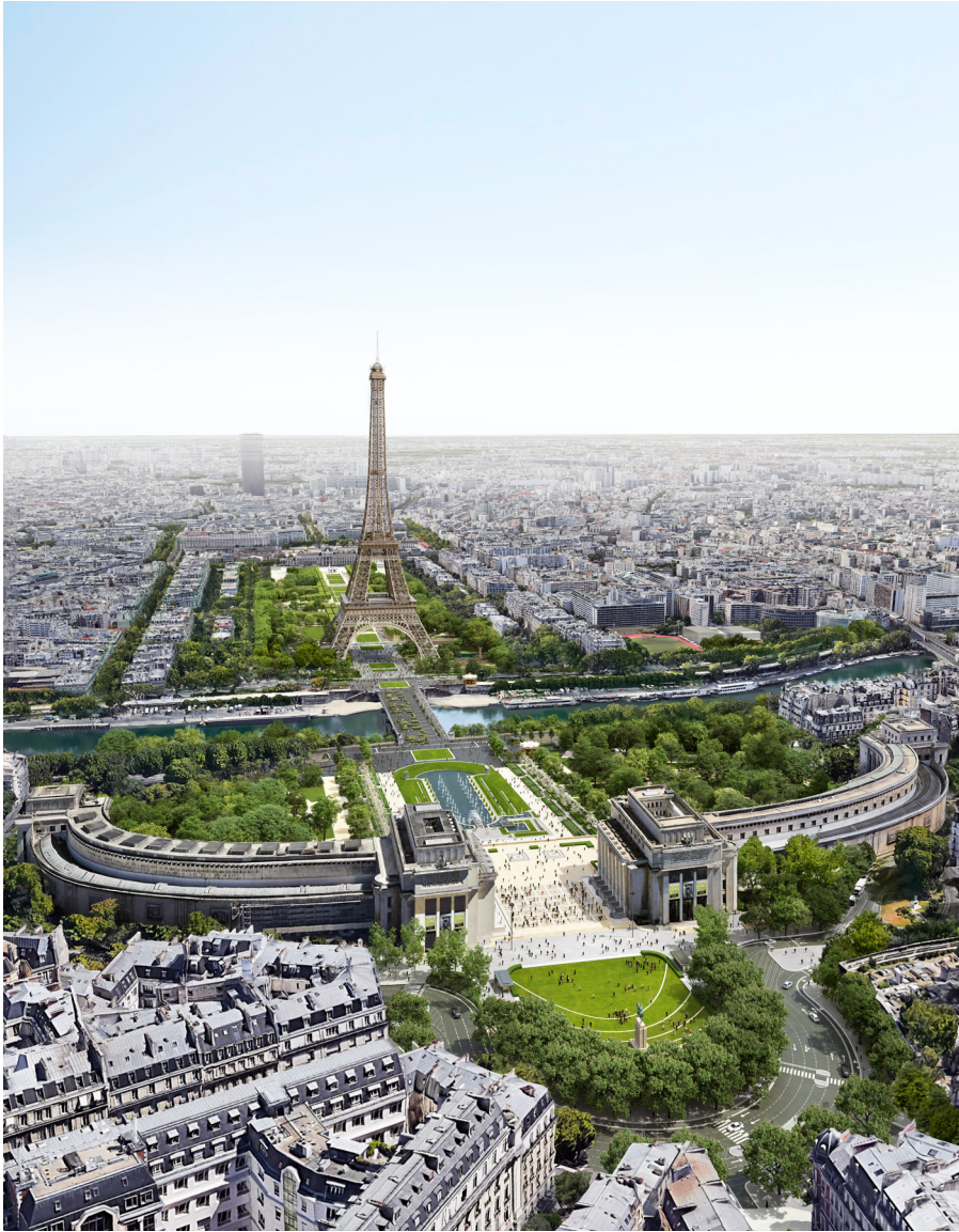
Aerial view of Site Tour Eiffel