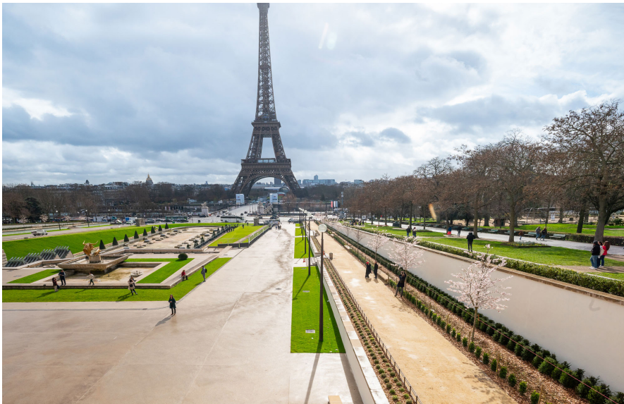
New alignment of blossoming cherry trees and lighting masts accentuate the axis of the promenades and terraces towards the Eiffel Tower and the River Seine.