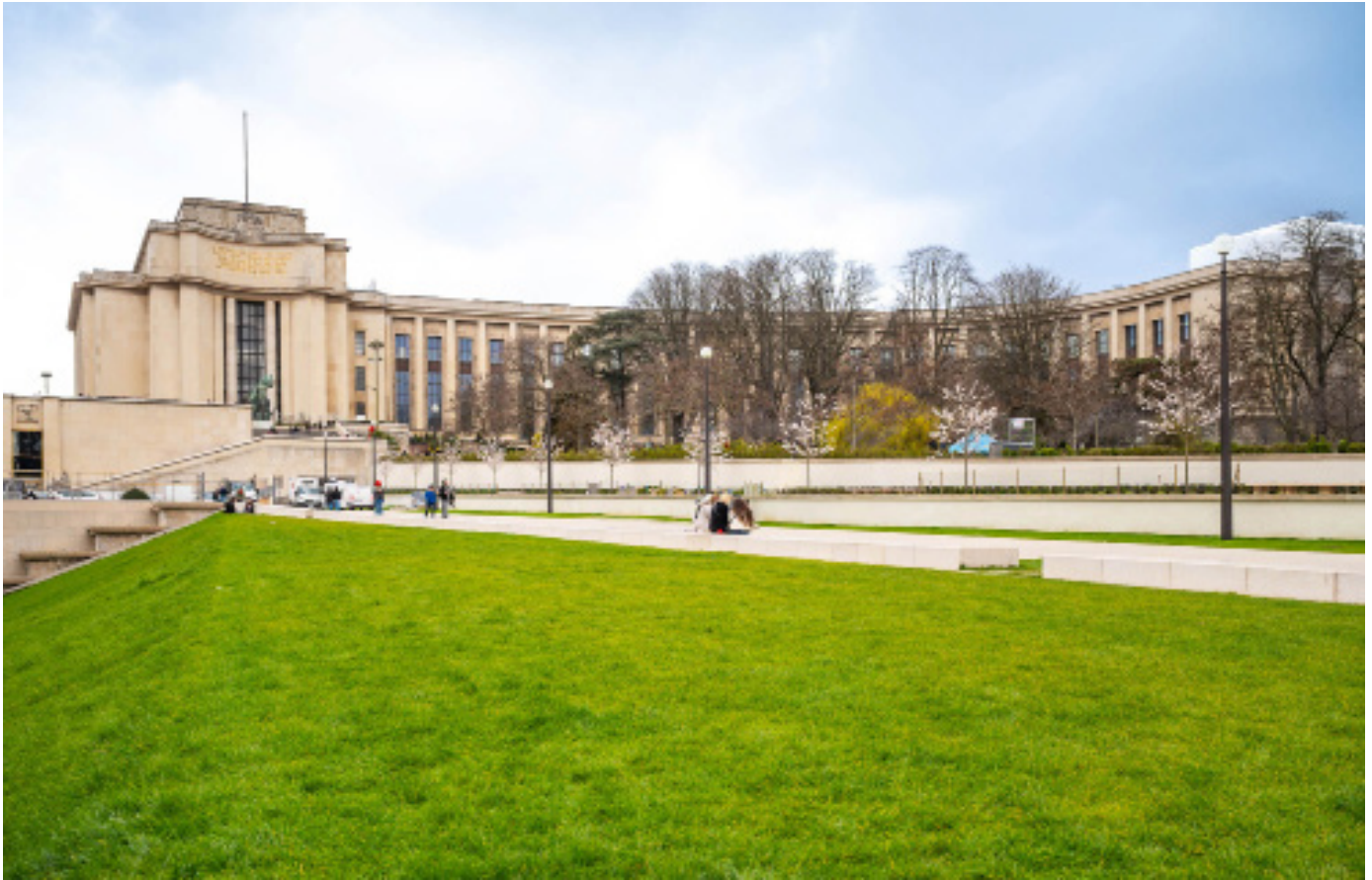
New limestone seating edge frames and protects the historical lawns.