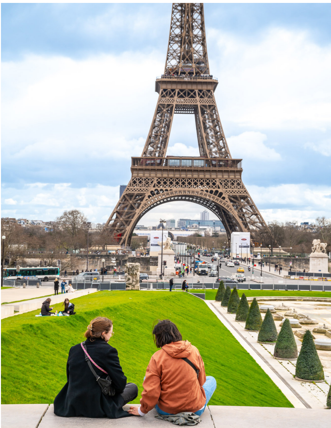
View from the historic lawns towards the Eiffel Tower.

OnE Restoration and enhancement of historic landscape around the Eiffel Tower