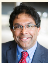
Riyaz Kanji Leading attorney on Native American rights and sovereignty