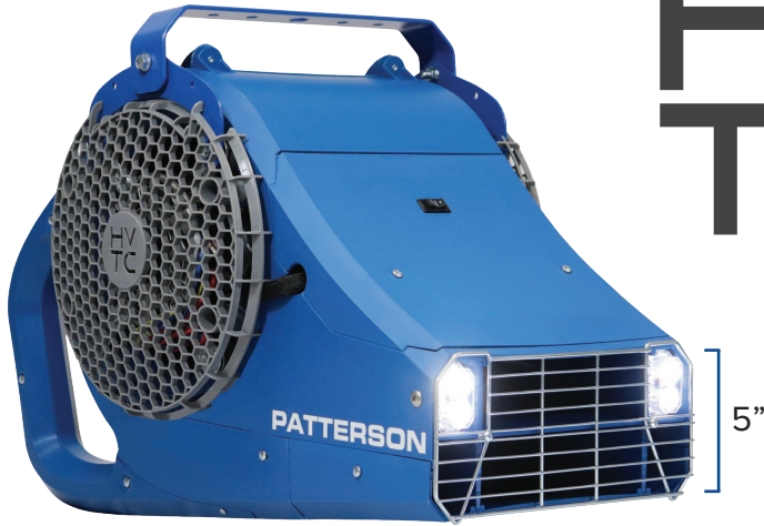
Optional Integrated LED Lights