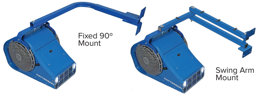
Fixed 90° Mount