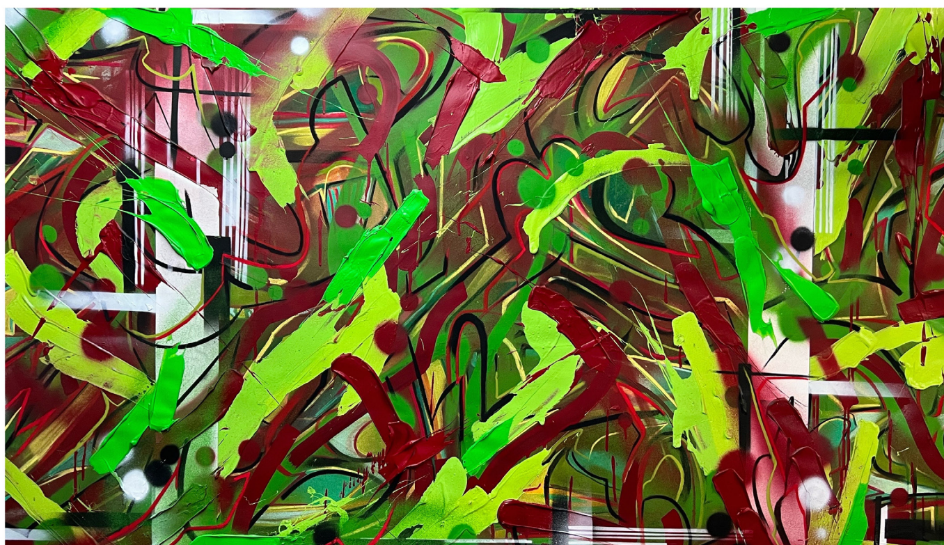
Kipton Hinsdale, Multiverse , 2023. Pastel, charcoal, acrylic and ink on paper. 36 x 62 inches.