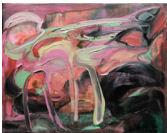
Bottom: Only in Dreams I , 2025. Oil on linen. 8 x 10 inches. $275.