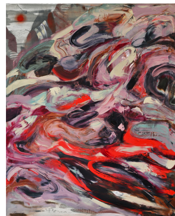
A Thousand Words (But Are We Heard?), 2024. Oil on canvas. 30 x 24 inches. $1,800.