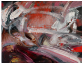
Bottom: Harness , 2025. Oil on linen. 8 x 10 inches. $275.