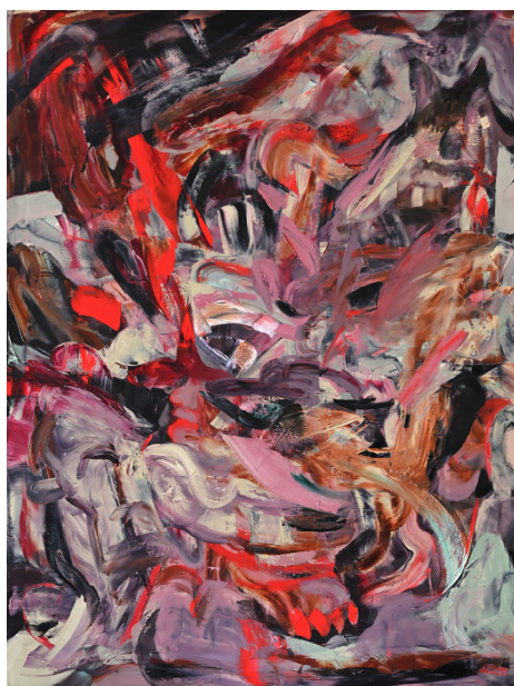
Monster Camouflage, 2024. Oil on canvas. 40 x 30 inches. $3,000.