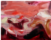
Bottom: Only in Dreams II , 2025. Oil on linen. 8 x 10 inches. $275.