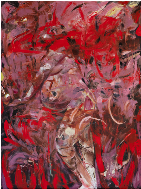
In the Belly of the Beast , 2025. Oil on linen. 40 x 30 inches. $3,000.