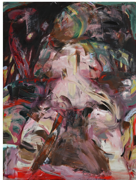
What She Builds, She Must Destroy, 2024. Oil on canvas. 40 x 30 inches. $3,000.