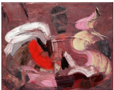
Top: Different Worlds , 2025. Oil on linen. 8 x 10 inches. $275.