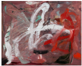
Top: Communication is Hard , 2025. Oil on linen. 8 x 10 inches. $275.