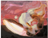
Top: Forgotten Pearl , 2025. Oil on linen. 8 x 10 inches. $275.