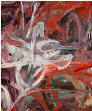
Conservation of Energy , 2025. Oil on linen. 24 x 20 inches. $1,200.