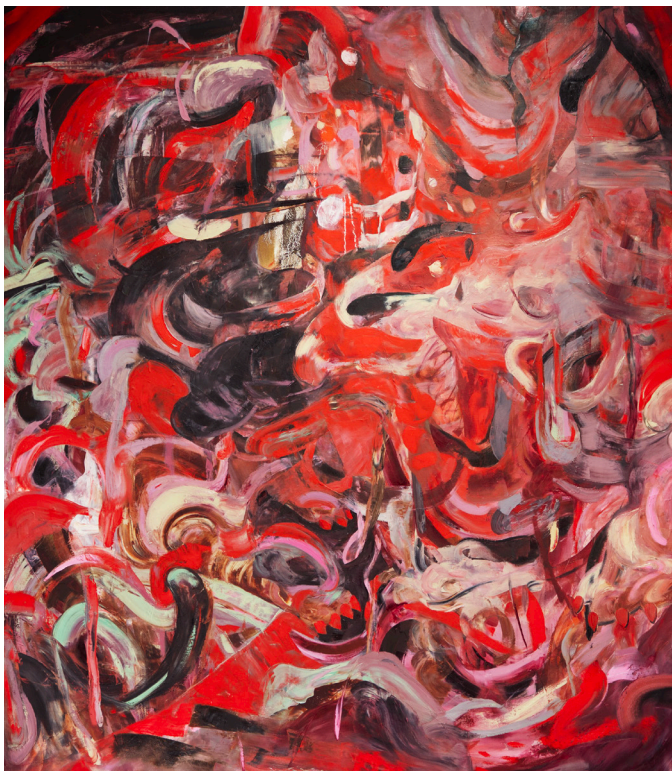
The Unraveling, 2025. Oil on canvas. 62 x 54 inches. $5,000.