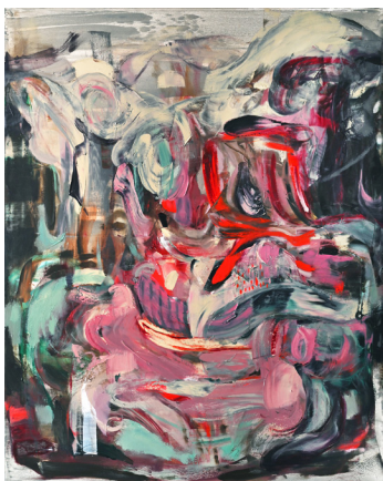
The Dancer, 2024. Oil on canvas. 30 x 24 inches. $1,800.