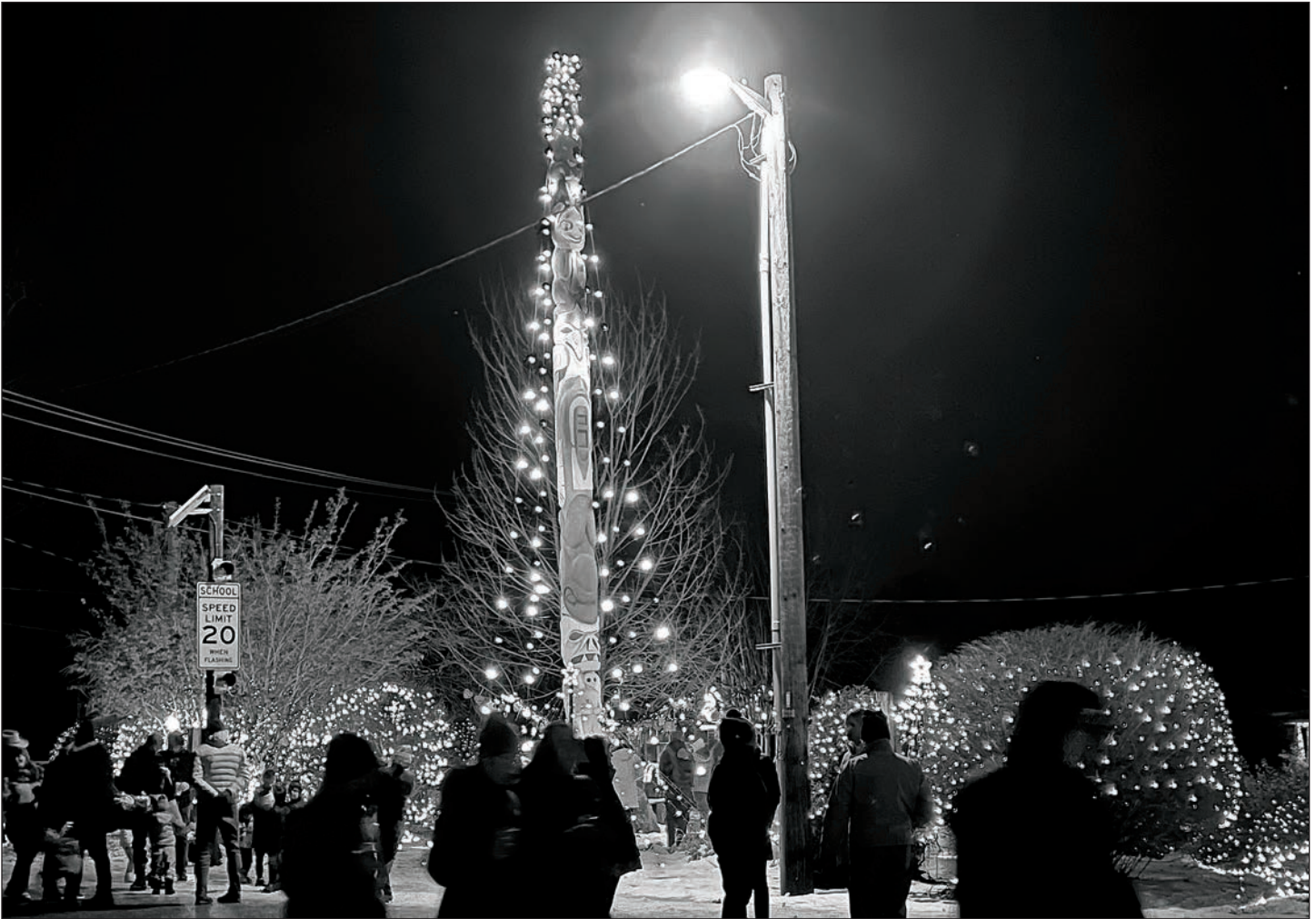
Winter lights on winter nights in downtown Fall City.