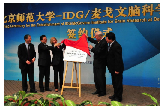
Figure 1Ceremony for the Establishment of IDG/McGovern Institute for Brain Research at Beijing Normal University

These new institutes were designed to foster cuttingedge research, integrating various disciplines of