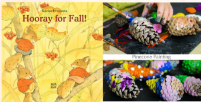
Hooray for Fall! by Kazuo Iwamura