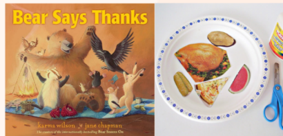
Bear Says Thanks by Karma Wilson