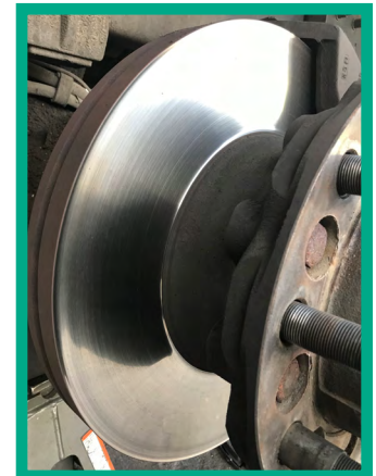
Outstanding rotor condition after use with BK8043

Backing plate designed to correct thickness