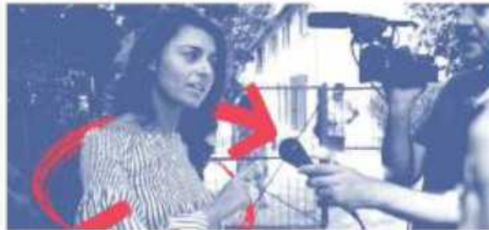
The Guardian , December 1, 2018

'Italians first': how the populist right became Italy's dominant force