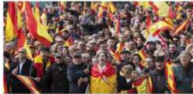
NPR , February 19, 2019