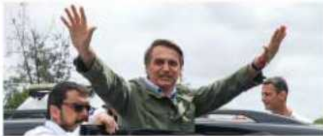
Wall Street Journal , October 28, 2018

Ex-army captain campaigned on harsh law-and-order platform