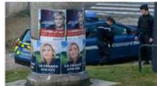
The Guardian, March 3, 2017

Man tipped for European commission president job says Brexit has shown political leaders the risks of failing anti-EU sentiment