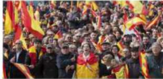
NPR , February 19, 2019

'Italians first': how the populist right became Italy's dominant force