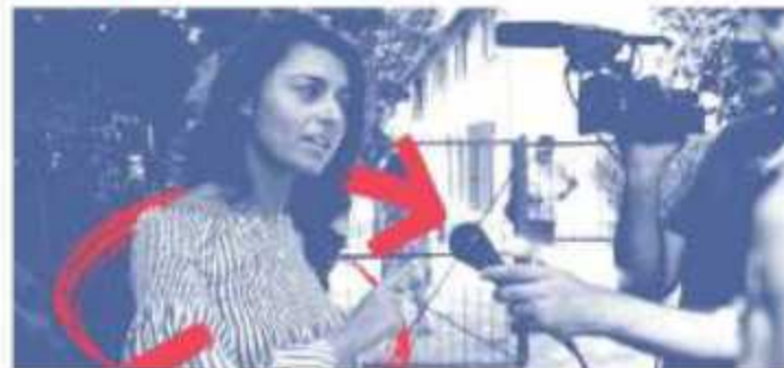
The Guardian , December 1, 2018