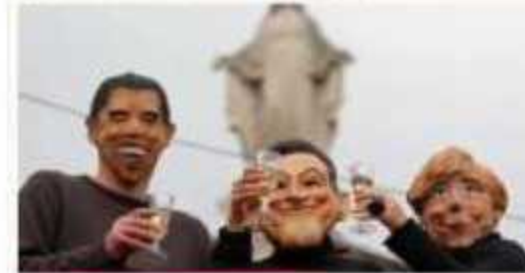
The Guardian, June 26, 2016