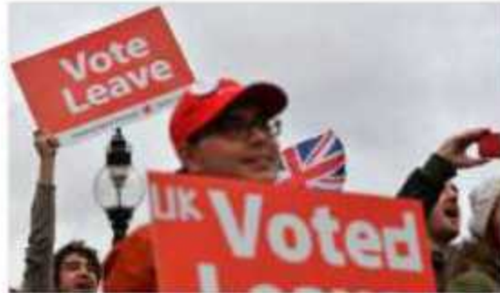
The Conversation, November 29, 2016