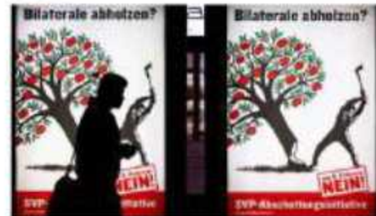
USA Today, March 31, 2014