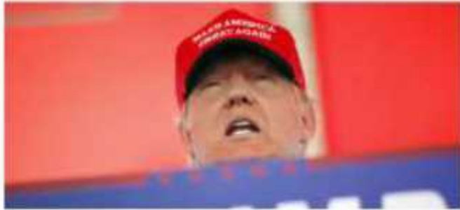
The Conversation , November 25, 2015