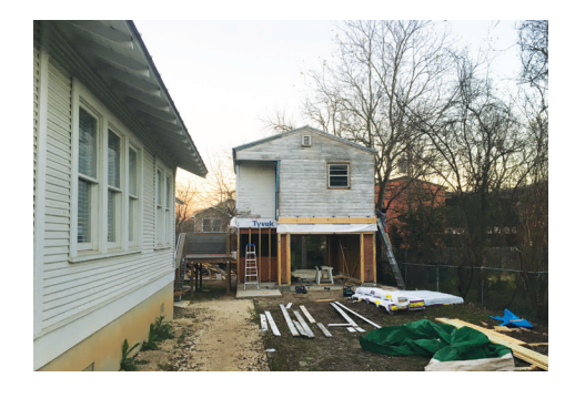
Built in 1937, a garage apartment was lowered, relocated and rotated 180 degrees, then lifted for reuse. In addition to a new exterior stair and one-car garage below, the interior renovation preserved the art deco details, pine flooring, and cabinetry, while adding a new bathroom, HVAC system, and plumbing.