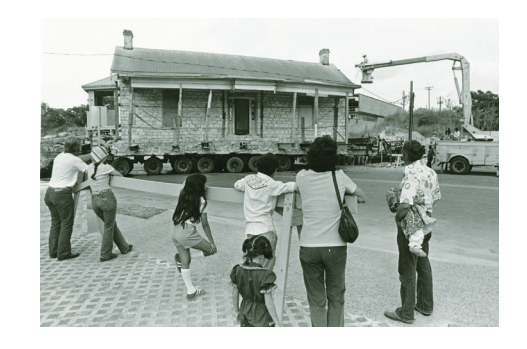
In 1975, Austinites watch as the William P. Hardeman House is relocated from 401 East 16th Street to 1111 Red River Street to become part of Symphony Square.