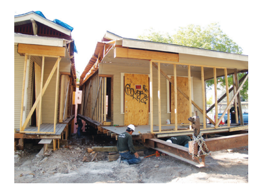
A bungalow is cut and lifted on temporary steel rails in preparation for relocation.

Logistical: Currently, the process of house relocation within the City of Austin is complex and time consuming. The many approvals and permissions required, tight timelines, and subcontractors needed make house relocation feel out of reach and/or unattractive to homeowners and developers. This guide lays out the steps for a house relocation project and provides project examples in efforts to demystify the process and foster the local practice.