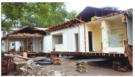
A Tarrytown house (above) is cut into multiple chunks (below) in preparation for relocation.