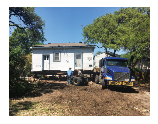
A 1933 main house approved for demolition was purchased by a general contractor and relocated outside of Austin. The porch, which extends the entire length of the front facade, was temporarily removed for transport.