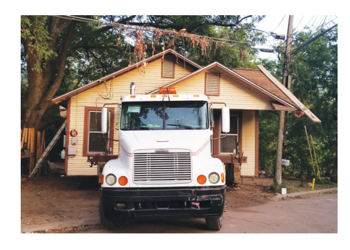
A house in East Austin is ready for transport.