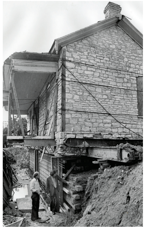
Following relocation to Symphony Square, a new foundation is designed to create a basement under the historic structure.