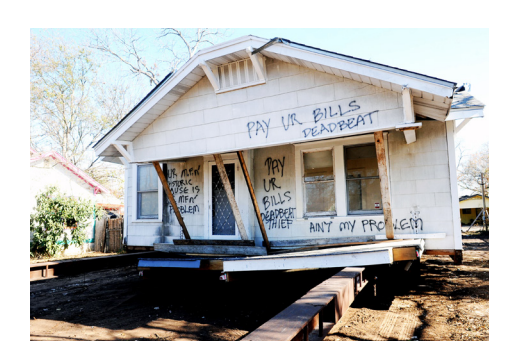
This early 1930s house on Red River Street was scheduled for demolition, but local residents spoke out at a Historic Landmark Commission meeting in hopes of preserving it. With plans to build a duplex, the owner agreed to relocate it. Two months later, the house was unexpectedly returned to the site along with messages from the house mover.