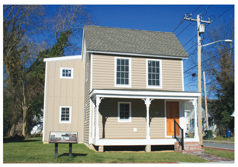
The Buffalo Soldier House in Easton, Maryland's Hill Neighborhood was slid 8 feet horizontally on steel rails using manpower and soap. Built circa 1869, the house was pushed away from modern power lines and the adjacent roadway, in preparation for a full rehabilitation designed by Encore Sustainable Architects and sale as an affordable home for a military veteran.