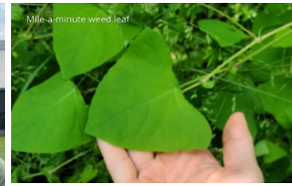
Mile-a-minute weed leaf