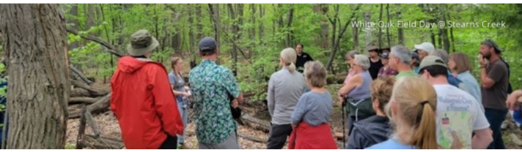
White Oak Field Day @ Stearns Creek

The Forestry Assistance Program (FAP) is here to help landowners achieve their goals for woodland management. In 2023, the FAP serviced 2,656 acres of forested land in Barry, Allegan, and Ottawa counties. The program had an estimated economic impact of $428,900 through referrals to local consultants and applications for funding through public programs. BCD's FAP partnered with the White Oak Initiative to put on 5 field days to showcase management of that species. The White Oak Initiative is a diverse coalition of partners committed to the long-term sustainability of America's white oak forests as well as the benefits they provide. These field days were hosted in conjunction with the American Tree Farm System, which works to sustain forests through the power of private stewardship by offering forest certification for family forest landowners in the United States. We look forward to providing similar field days through programs like these in 2024!