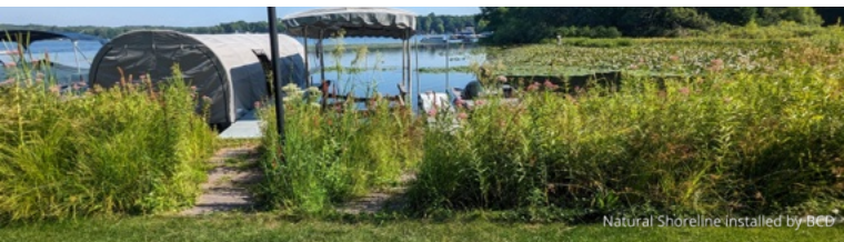
Natural Shoreline installed by BCD