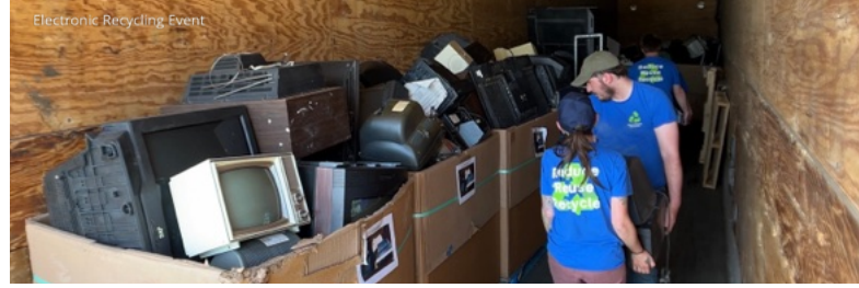
Electronic Recycling Event

Landowners of Barry County have access to programs that offer assistance to implement conservation practices through the local NRCS office. The Environmental Quality Incentives Program (EQIP) which had 15 contracts in 2023, many for forest management and cover crops. Conservation Reserve Program (CRP) which helps remove environmentally sensitive land from agricultural production, was utilized by 23 landowners. Regional Conservation Partnership Program (RCPP) had 2 wildlife focused projects go to contract in 2023. The Conservation Stewardship Program (CSP) helps you build on existing conservation efforts had two applications go to contract. NRCS office is looking forward to further assisting landowners and working with the new MAEAP technician.