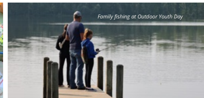
Family fishing at Outdoor Youth Day