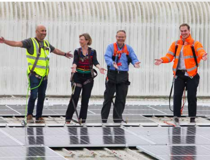
Low Carbon Hub

Ebico Ltd is a not-for-profit gas and electricity supplier aiming to offer a better, fairer deal for domestic energy to British households. READ MORE