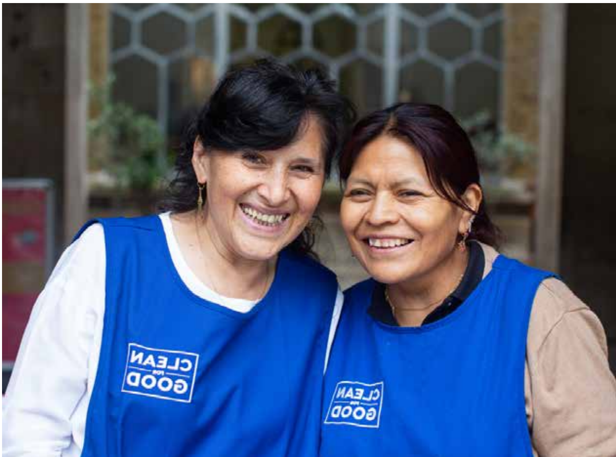
Clean for Good

93% of employee-owned businesses invested in on-the-job learning and development training in the last 12 months compared to 85% of other businesses; employee-owned businesses spend an average of £38,000 (12%) more on training per company.