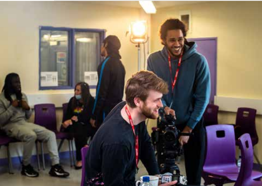
Inside Job Productions

is a film production company that creates content ranging from film and animation to photography and digital presentations and provides work experience and employment opportunities for young people, including a project based in HMP Wandsworth working with prisoners to create content focused on mental health.