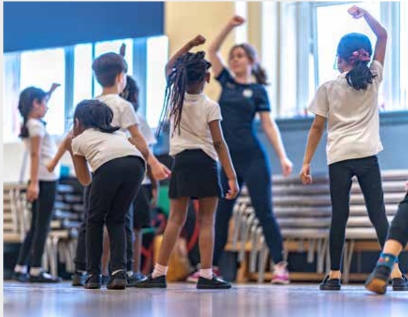
Dream Big Sports

Skipz Productions CIC provides performing arts (acting, drama, dance, singing, music), film and art workshops and clubs for children aged four to adult, working with local schools and housing associations to bring these workshops to the community. READ MORE