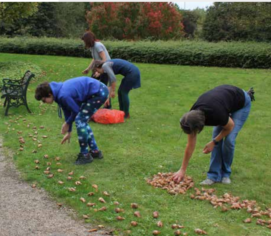
Little Green Change

ProgressiveEducation.org is a hub exploring innovations inside and outside of the school system and is a community of 8,000 parents/carers, teachers, academics, psychologists, researchers and pioneering education innovators. READ MORE