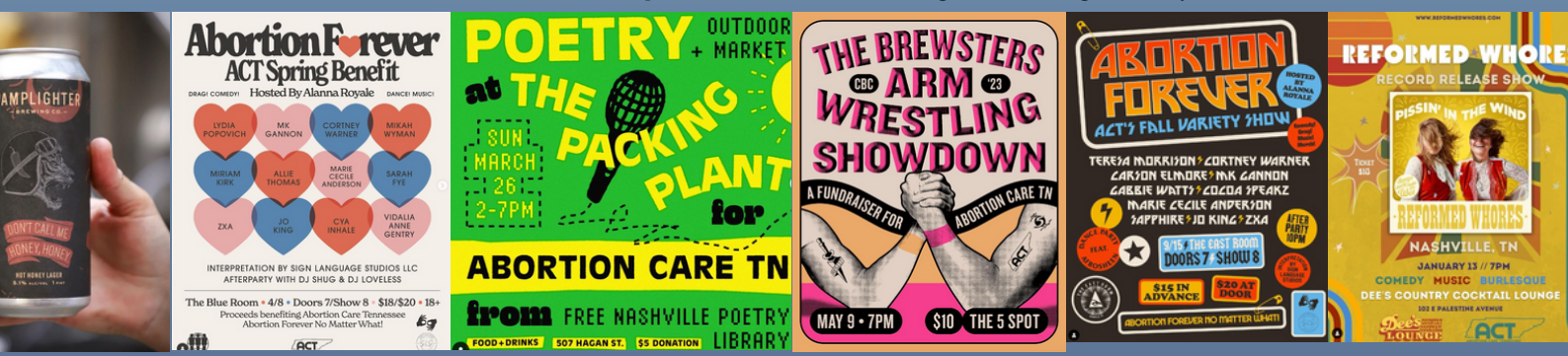
IMAGE DESCRIPTION: Posters: A scroll of multi-colored event posters from ACT's fundraising events throughout the year