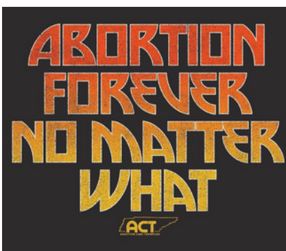
IMAGE DESCRIPTIONS: iMerch: A scroll of 4 images of ACT's merch designs, which reads "ABORTION FOREVER NO MATTER WHAT" in different, multi-colored fonts.