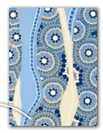
artwork created by students

Scan QR code to see how other schools promote their values.