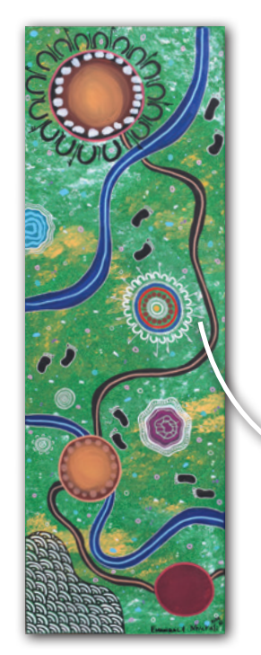
artwork created by local artists