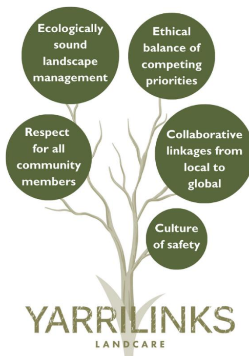
Figure 6. Our guiding principles.