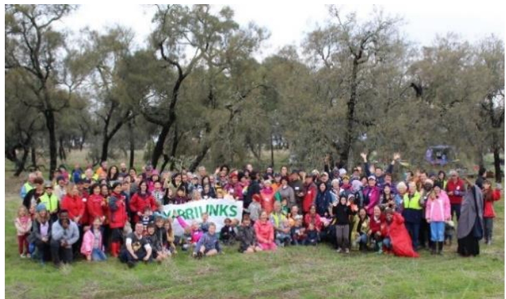
Figure 1. Group photo from the 2017 Community Planting Weekend near Minyip.

The annual Community Planting Weekend (Figure 1) was a feature of Yarrilinks for over 20 years, with over 1000 volunteers from 30 different nationalities involved. A community-hosted billeting system saw these volunteers, many of them refugees or recent immigrants to Australia, invited to travel from Melbourne to experience country life and take part in a community environmental project. In addition to getting trees in the ground, the events were a valuable opportunity for two-way cultural exchange.