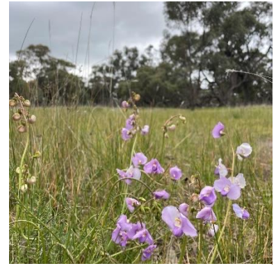
Figure 10. Broughton pea in bloom at Barrabool FFR.

This region has some of the largest areas of remnant native vegetation in the Yarrilinks area: Brynterion State Forest along the Dunmunkle Creek and Barrabool FFR along the Wimmera River. These reserves are important wildlife habitat and support threatened species of birds, orchids, and other wildlife.