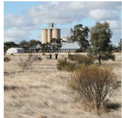
Figure 7. Community planting at the Lah Rec Reserve.

This group has been affected by a downturn in activity following the pandemic.