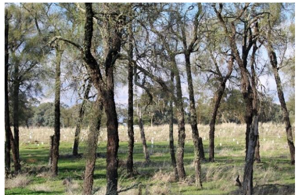
Figure 14. A Yarrilinks planting extends a buloke woodland near Minyip.

The Buloke Woodlands (Figure 14) of the Riverina and Murray-Darling Depression Bioregions are listed as an Endangered Ecological Community by the Australian Government (EPBC Act 1999). Fragments of these woodlands occur across the Yarrilinks area and many past planting projects have sought to link or expand these remnant stands. The buloke ( Allocasuarina luehmannii ) and Buloke Mistletoe ( Amyema linophylla subsp. orientalis ) are listed as critically endangered under the Flora and Fauna Guarantee Act (FFG).