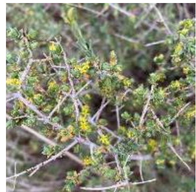
Figure 8. Wimmera Riceflower at Minyip Wetlands.

In future the group plans to continue bus trips and has planting projects planned for the coming years.