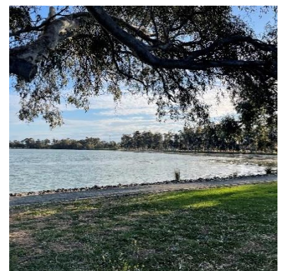
Figure 13. Lake Marma at Murtoa.

Recently Yarrilinks supported the CoM in applying for a Victorian Landcare Grant to undertake weed control around the lake.