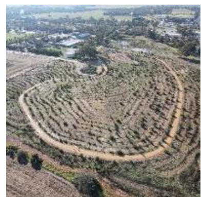
Figure 9. Aerial view of planting at the Rupanyup Reservoir.

Although the group remained active through Covid, the major challenge faced by the group is declining membership and lack of involvement. Most activity and on-ground work is spearheaded by a small number of individuals and there is a perception that the broadacre cropping focused area limits interest in Landcare.