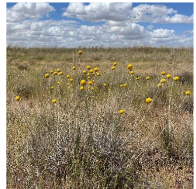
Figure 12. Billy buttons in a roadside remnant grassland.

Yarrilinks planting weekends have taken place in this area. Some roadsides in this region support rare native grassland remnants.