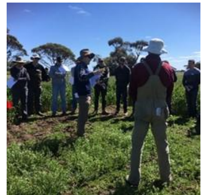
Figure 11. Farmers gather for a field day near Wallup.

In the past the group has collaborated with Yarrilinks to plant trees at the Wallup Rec Reserve. Barrett FFR, one of the larger remnant vegetation reserves in the Yarrilinks area, is in this vicinity.