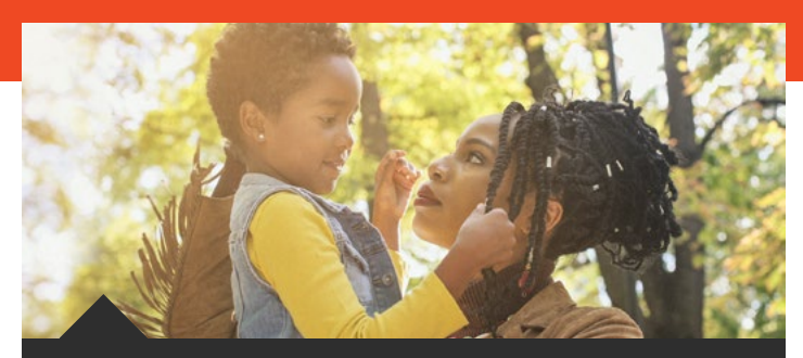
Strengthen YWCA Programs and Services

We call on members of Congress to act on the following health, economic, safety, and racial justice priorities areas: