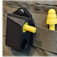
MOLLE Mount Earplugs