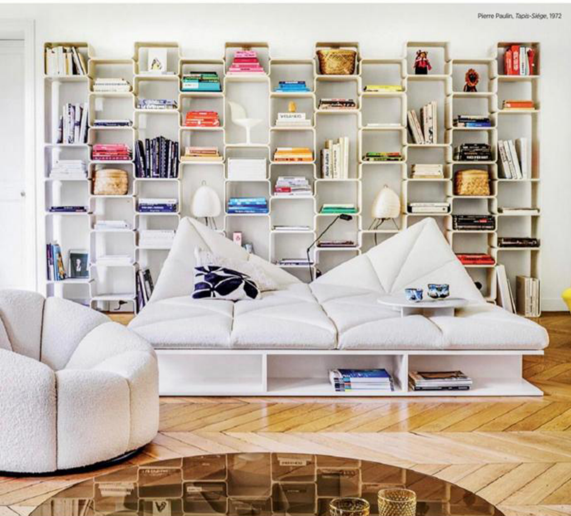
Pierre Paulin, Tapis-Siège, 1972

Art has a magical way of speaking without words. Expressions of love and pain, heaven and earth, sunrise and sunset have all been revealed in a single universal language made up of brushstrokes and colours, memories and moments. It goes beyond that when people unite to elevate it for a higher cause such as a charity auction and that is what auction house, Christie's is hoping to achieve with its upcoming charity sale taking place online in November.