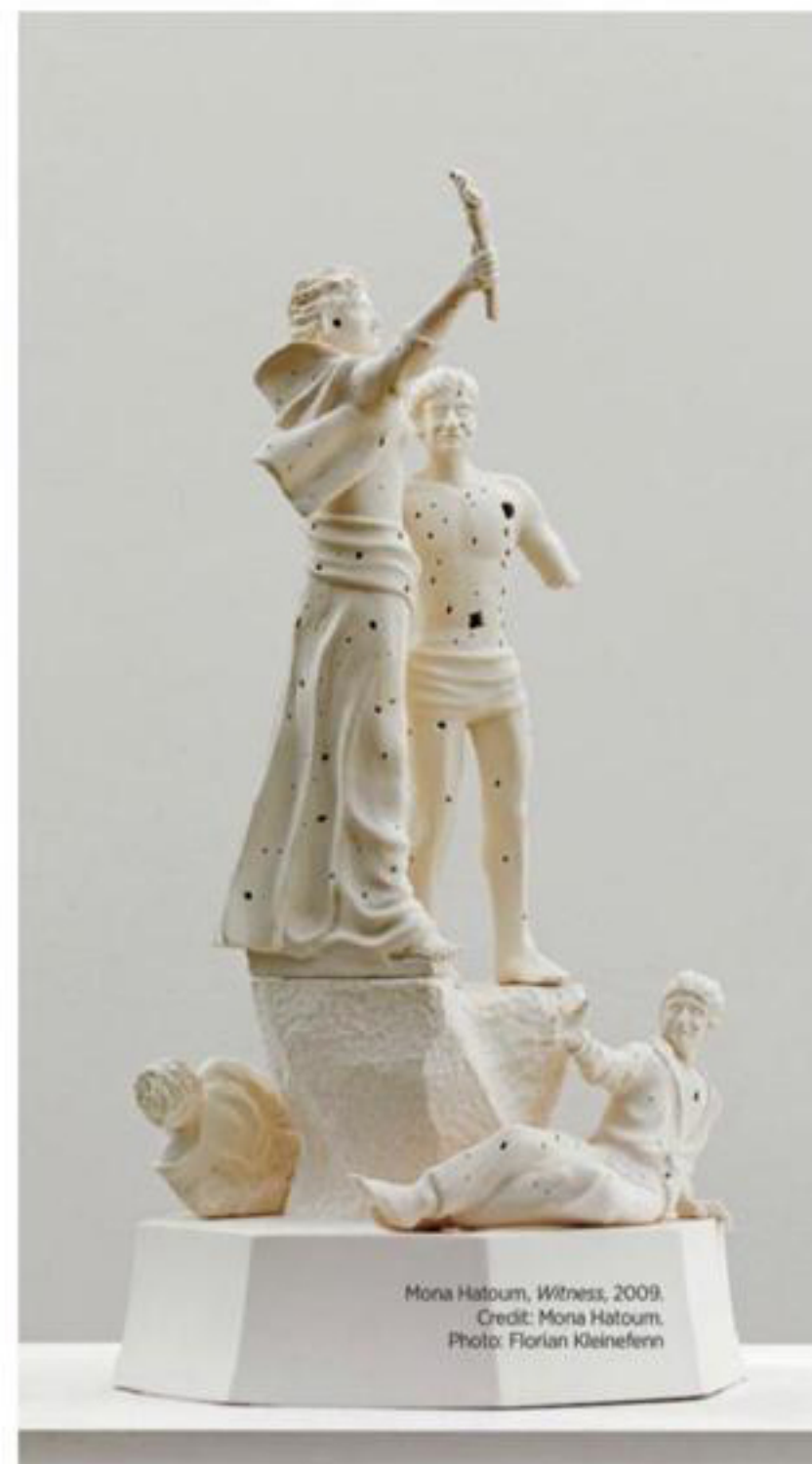
Mona Hatoum, Witness, 2009.

With Christie's aiming to raise above half a million dollars