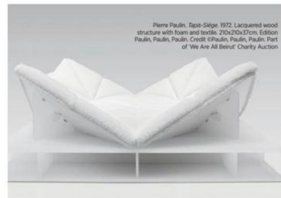
Pierre Paulin, Tapis-Siège, 1972. Lacquered wood structure with foam and textile. 210x210x37cm. Edition Paulin, Paulin, Paulin. Part of 'We Are All Beirut' Charity Auction