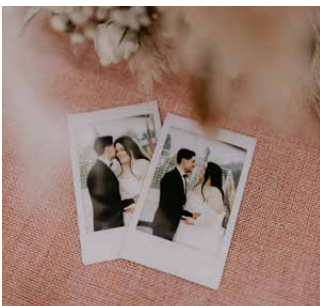
Blush Linen Table Cloth @ $35 each