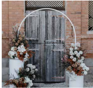
Arch Arbor (no plinth or florals) @ $180