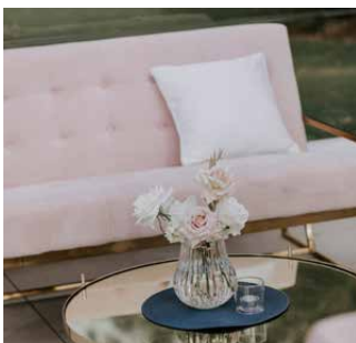
Blush Velvet Lounge set @ $350 (1x velvet lounge 3 seater, 2 velvet chairs, 2 cushions, 1 golden coffee table)