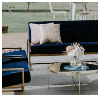
Navy Velvet Lounge set @ $350 2x velvet lounge 3 seater, 1 ottoman, 1 golden coffee table)