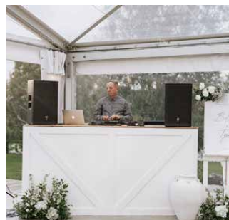
White DJ Bar @ $200