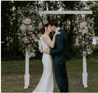
White Arbor @ $180

Looking for a few extra styling items, so you can pimp up your wedding day? Save on unnecessary delivery or set up fee, it's all in house :o) Have a look at the below items & create your dream wedding.