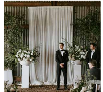
Wet Weather white curtain @ $150