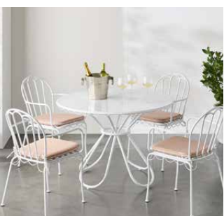
French Provincial table & chairs set each @ $180 (2 sets available)