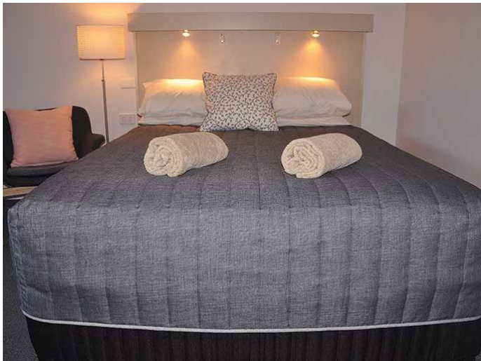
Maffra Motor Inn