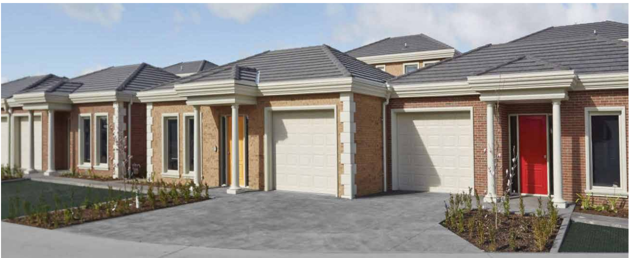
The Mansi on Raymond