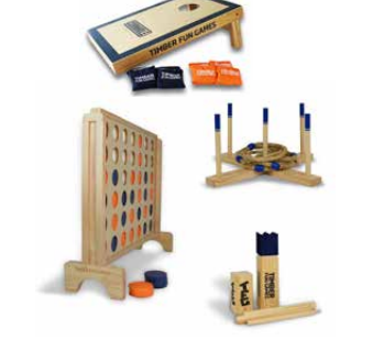
4 x Giant lawn games @ $120 (4 connect, Bean Bag Toss, Ring Toss, King Kubbs)