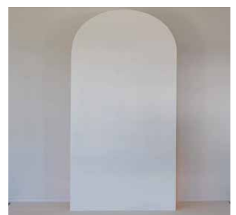
White Arch backdrop and/or white ripple plinth @ $120 | $250