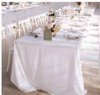
White Table Cloth @ $35 each