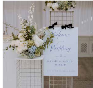
White mesh pillars set of 4 @ $180