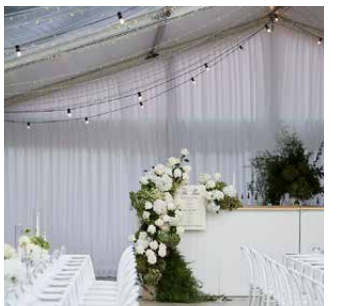
White chiffon backdrop @ $300 (behind bar or room separation in marquee)