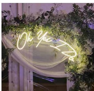
Neon sign 'Oh Yes baby I do' @ $220