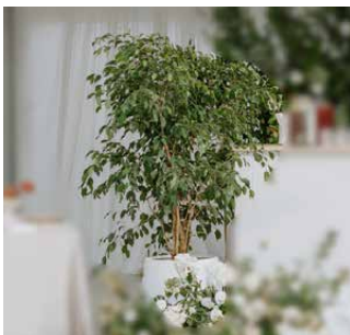
Ficus Tree in white pot each @ $150 (*6x available, marquee only)