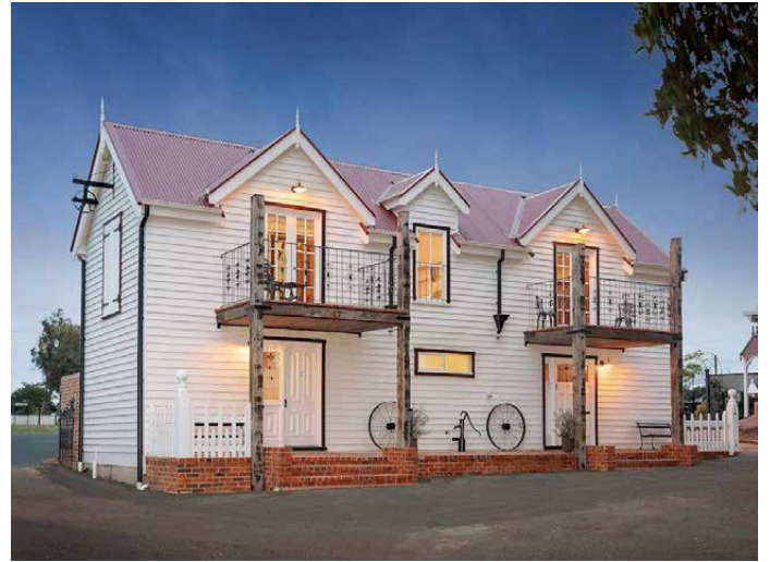
Duart Homestead Stables