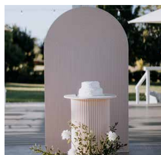
White or Blush pink ripple Arch backdrop and/or plinth @ $120 | $250