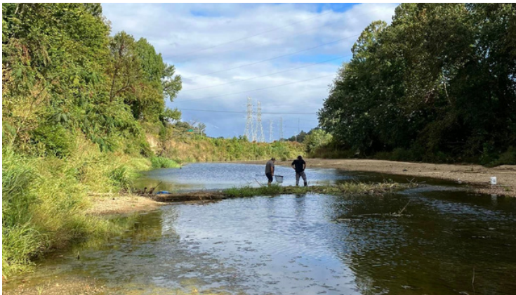
Checking out the beaver dam near Halle Stadium

On Sunday October 15 we had a field trip to Hickory Hill Park. Eight of us including some new faces walked the one mile trail loop through the park. We stopped to check out a few things along the way. The weather was a little off, but despite the threat of rain we only had a few stray raindrops. Since the initial hike was short about half of the group opted to pay a visit to the section of the Creek by Halle Stadium. Part two of the field trip gave us a chance to document a few more fish species in the creek. We also checked out a recently built beaver dam and some of the exposed deposits along the creek from the last ice age.