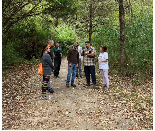
The group pauses to check out some plants at Hickory Hill Park