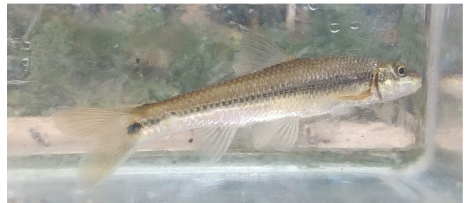
A suckermouth minnow ( Phenacobius mirabilis )