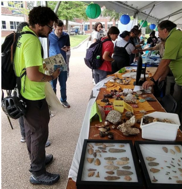
Nonconnah Creek Conservancy at "Tiger Blue Goes Green"

On October 4th we had a table at the U of M's Tiger Blue Goes Green event. This annual event promotes sustainability and being mindful of the environment. During the course of the event we had a chance to talk to quite a few people about the conservancy and show them some of the cool stuff that can be found along Nonconnah Creek.