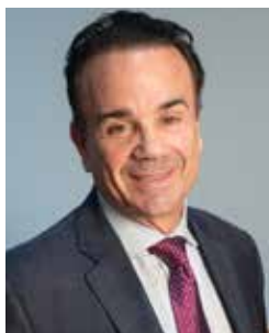
Mayor Joseph P. Ganim

Mayor Ganim WELCOMES YOU to the Bridgeport Art Trail,