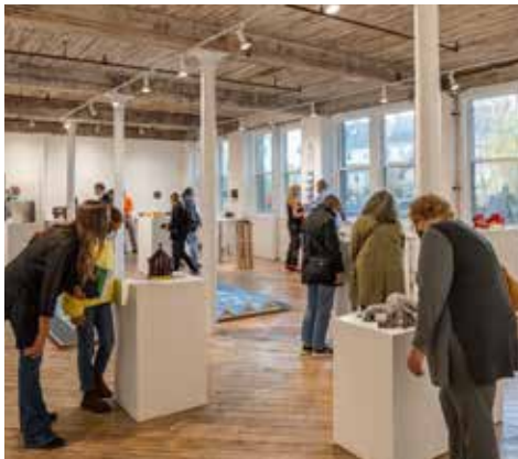
Crown Art gallery at Metro Art Studios # 7.