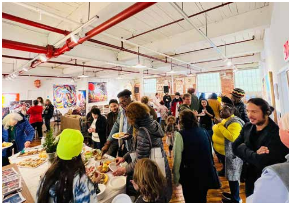
Artist's brunch at the NEST #31