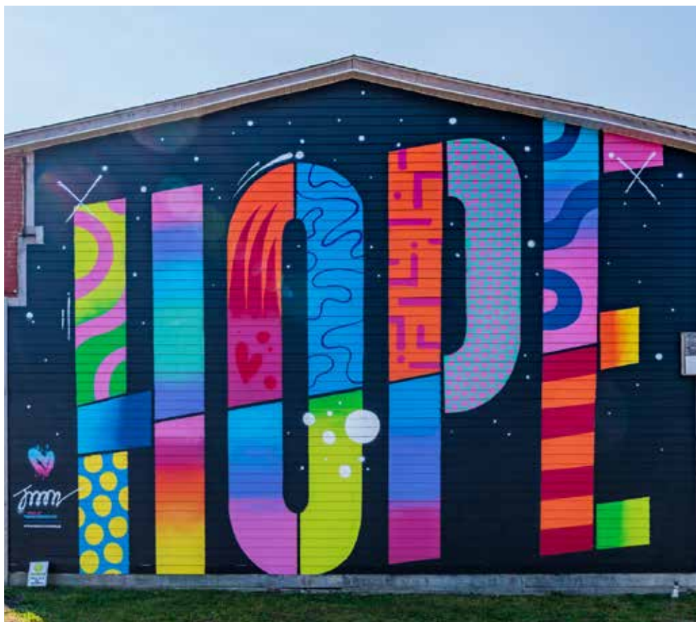
Murals at The Knowlston Walls