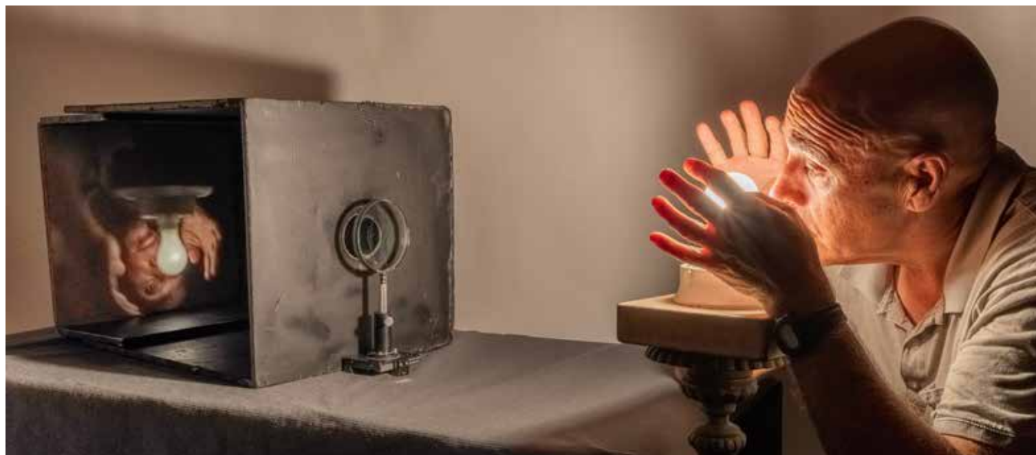
Photographer Tom Mezzantte, photo by Dariusz Kanarek