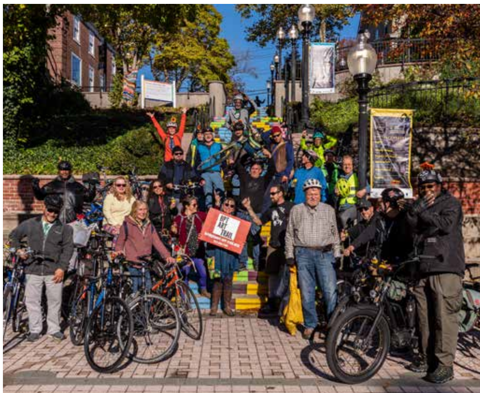
BAT Urban Bike Tour #22 a