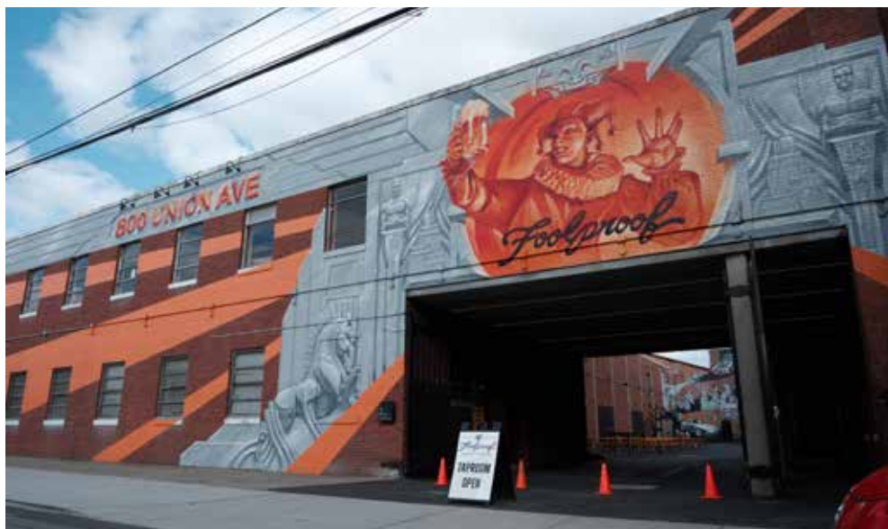
FoolProof Brewing/MNTD studios #3

After a weekend packed with art, wind down at 785 Union Ave. Mingle with other BAT visitors and artists. Enjoy live music, Foolproof libations and a nosh and art on view.