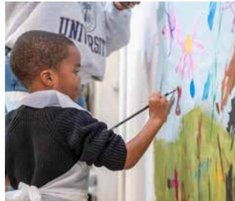
Public mural activity BAT 2023