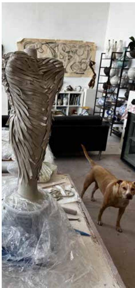
Art studio of Jocelyn Braxton Armstrong at American Fabrics #1